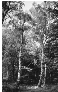
Figure 1. Birches

(2) A second question that is covered in many studies is that of the form of the AD, or how to render specific visual information verbally. One particular problem in this respect is that, to a high degree, images seem pre-filled with meaning for us and are therefore—particularly on the concrete level—much more specific than words. When we look at Figure 1, we all agree that it is a picture of trees. Most of us will recognize them as deciduous trees and a fair number will be able to identify the characteristic trunk of birches. However, when we ask people to draw a tree, chances are relatively small that they will draw a birch unless we specifically ask them to do so. In other words, there does not seem to be in visual language an equivalent of the generalizing superordinate terms in natural languages; a tree in visual languages is always a very specific tree. This means that meaning-activation in verbal communication is always a much more personal process: the more general the verbal term used, the more options the reader or listener will have to make a mental representation of it. As such, the question of how to describe is to a large extent open-ended.