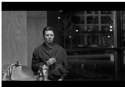
Column 2: German subtitles