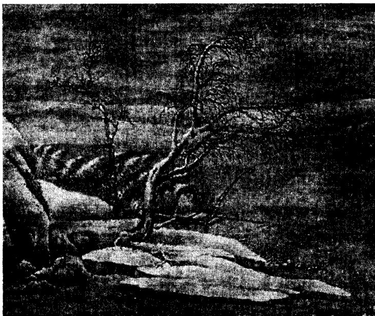
独钓寒江雪 马麟画 Fishing alone on a cold river, by Ma Lin, Song (960-1279)