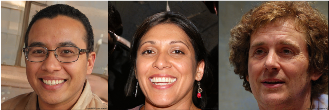
Figure 2: Portraits generated on the website thispersondoesnotexist.com (2024).

(see Figure 2). PimEyes finds faces similar to a person that doesn't exist, provoking questions both about the generated image used as a query and the status of the results. When visiting the offered, linked websites, the confusion increases as the user struggles to determine if the images pictured are synthetic or real. At this stage of development, PimEyes is a "technology in the making," and what kind of scenarios might be available in the future is only speculation.