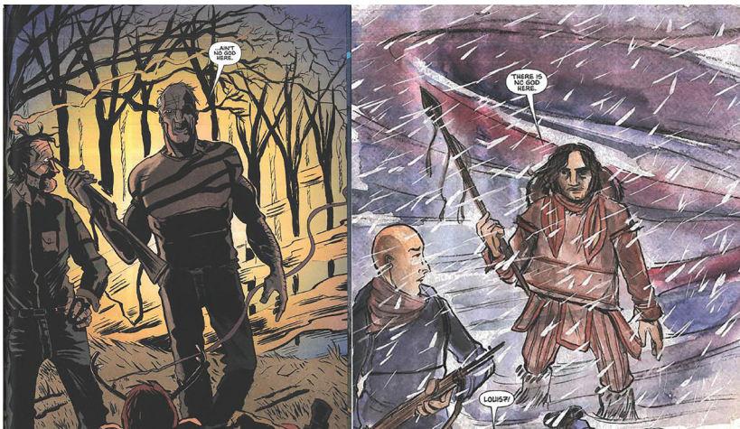
Figures 3 (I: 29) and 4 (III: 26)

The truth is revealed in full two issues later when the narrative provides an explanation of the dream. Matt Kindt, an American comics artist, took over the artwork for three issues to allow Lemire time for other projects, and this resulted in a distinct visual difference between Kindt's work and Lemire's work. Kindt's way of drawing the human body differs such that readers are reminded that they are seeing a new artist's work. However, this visual difference is fitting as the narrative abruptly moves backward from the future to 1911. The first inset caption of issue 28 reads "the personal journal of Dr. James Thacker, September 4, 1911" (III: 7). This narrative flashback and difference in artistic style place added interpretive weight on this section. Kindt includes an ominous sign of a disastrous encounter between the Inuit and European explorers in the shape of a church full of diseased corpses (III: 21). Thacker and his men then encounter Louis, now garbed in Inuit clothing, as he declares that "there is no god here" (Figure 4). This panel