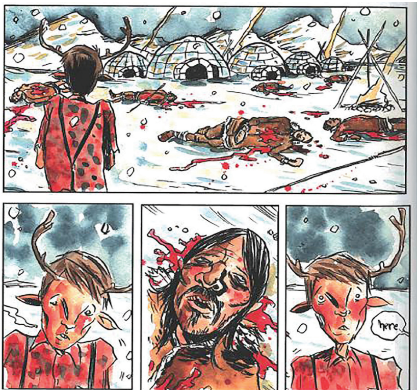
Figure 2 (II: 264)

Furthermore, when the narrative shifts to Alaska, the Inuit become important figures in the plot. When Dr. Singh, the chief scientist for the primary antagonist and warlord Abbott, realizes that the outbreak likely began at a military base in Anchor Bay, Alaska (II: 83), all of the major characters begin to journey north. Although there are mysterious hints of Gus’s connection to an Inuit cosmology when a bear sees Gus as an Inuit