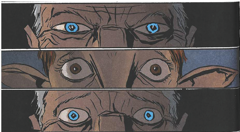
Figure 5 (I: 36)

de Almeida Cardoso argues that Lemire uses the eyes as a “mechanism of sympathetic identification through the gaze” (para. 19). On a narrative level, Gus and Jeppard are looking at each other. On a visual level, readers are given alternating point-of-view shots, placing them in Gus’s and Jeppard’s bodies — we see what they see. But there is a secondary effect whereby Jeppard and Gus seem to be looking directly out of the page at the reader. These panels invite sympathetic identification with the characters, but they also unsettle the reader.