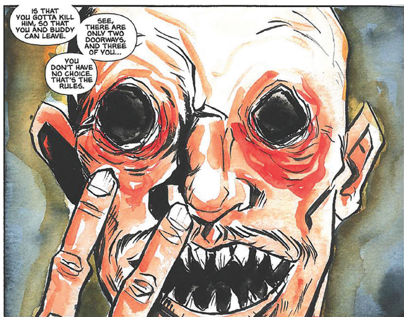
Figure 7 (II: 280)

At the end of the narrative, the only survivors are the human-animal hybrids who make peace with the now infertile human survivors and allow them to die peacefully of disease or old age. Lemire reveals this complete destruction of humanity only in the final issue of the series, and in doing so he breaks from most post-apocalyptic narratives as humanity does meet its final end. Read as a social critique, Sweet Tooth suggests that the “historical” encounter of one group of Inuit with colonialism and disease in 1911 is the direct cause of the apocalyptic end for all humanity in the future. In a strange repetition of the historical settlement of North America, introduced disease again causes catastrophic damage, only this time it kills all humans. Pushed further, the return of disease functions ironically to produce a “new world” in a kind of historical justice granted to Sweet Tooth ’s Indigenous/hybrid children.