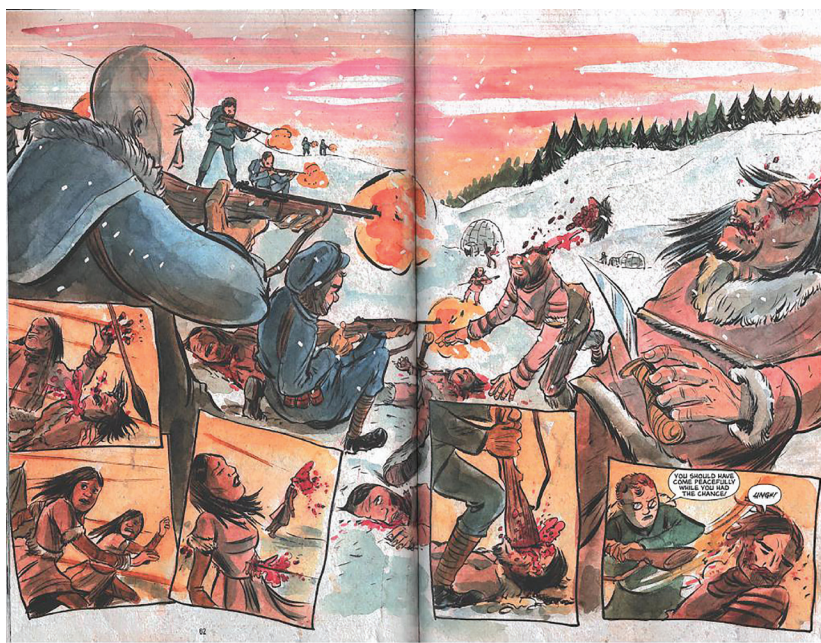
Figure 1 (III: 62-63) 1

TWO-THIRDS OF THE WAY THROUGH Jeff Lemire's post-apocalyptic comic Sweet Tooth , readers are confronted with a visceral two-page spread detailing the massacre of an Inuit community by European explorers (Figure 1). Although Lemire does not shy away from violence in Sweet Tooth , the decision to use a two-page spread amplifies the horror of what unfolds and the cold brutality of James Thacker, a British doctor searching for Louis Simpson, his missing brother-in-law, and the European crew of the expedition. The violence is doubly emphasized by five inset panels that further illustrate the massacre without providing any text aside from Thacker's ironic statement to his brother-in-law that