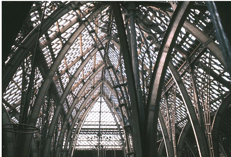
Figure 2: Oxford University Museum of Natural History, iron and glass roof.

the very “clear and colourless” nature of “a beam of light . . . when received with the sun” impresses Paley with how “well mixed and blended” it must be (198). Admitting a great wash of clear light, through a roof made entirely of colourless glass, was an extraordinarily bold and original move on the architects’, Deane and Woodward’s, part, and one that created the visual signature for the great natural history museums of Victorian England. This natural light allowed professors, students, and visitors to, in Paley’s phrase, “distinguish . . . objects” (198) and their salient features better than ever before in a museum setting.