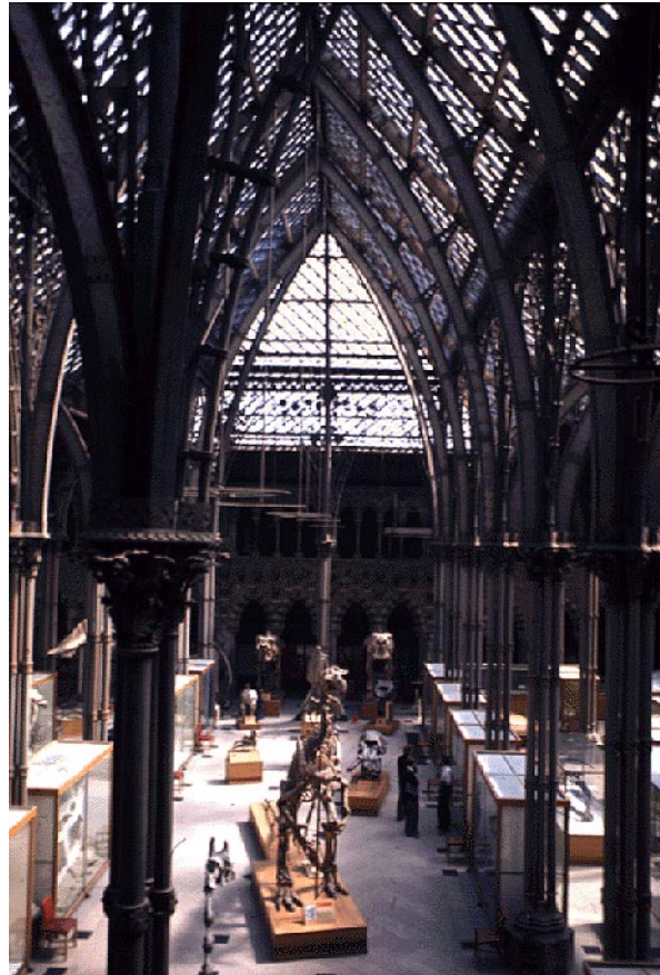
Figure 1: Oxford University Museum of Natural History, iron and glass roof, botanical capitals.