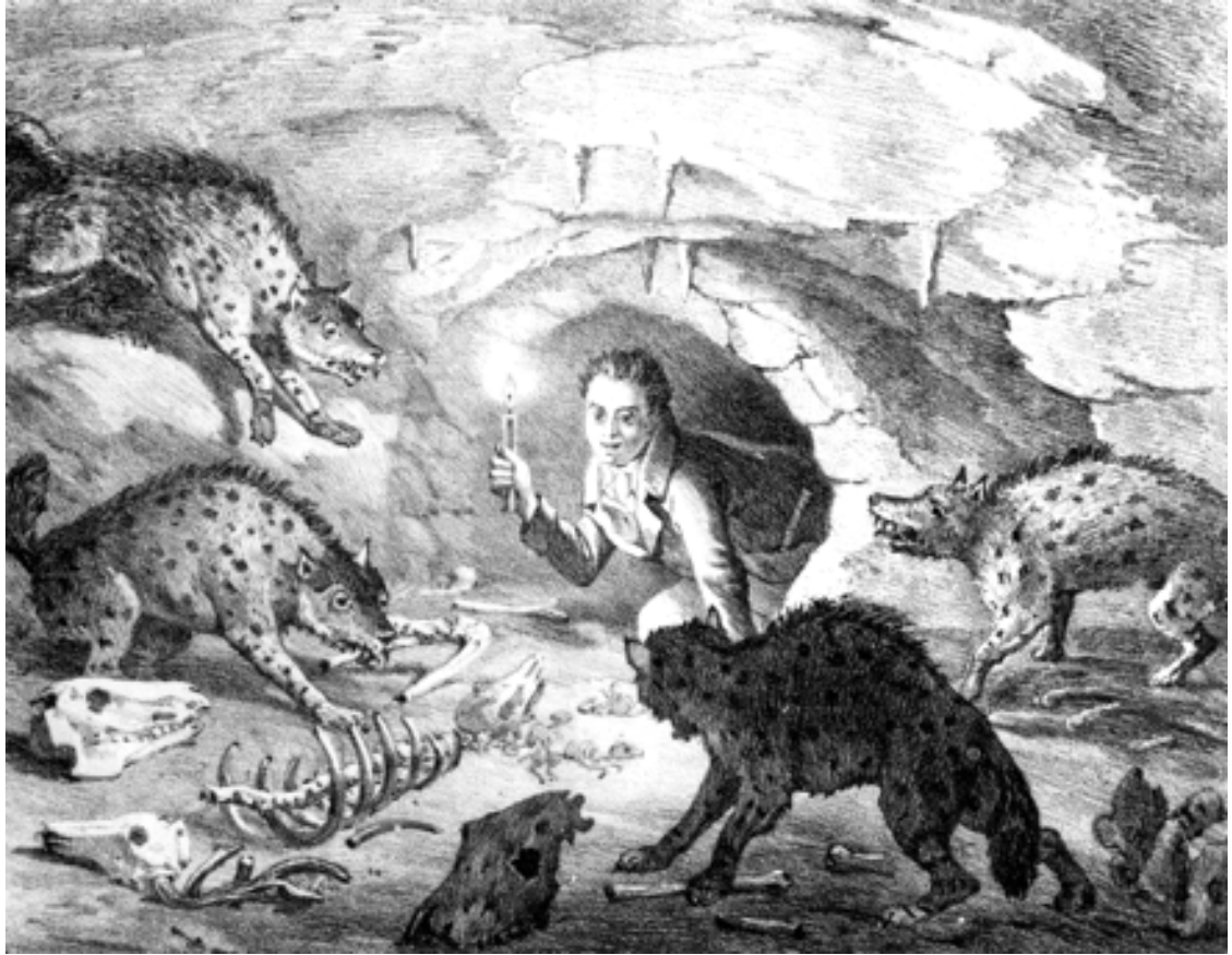
Figure 3: The Rev. William Conybeare’s drawing of his friend William Buckland in the Kirkdale Cave in 1821.