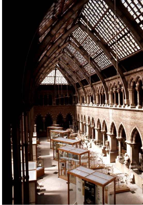
Figure 5: Upper- and lower-storey columns, each constructed from a different British stone, in the Oxford University Museum of Natural History.