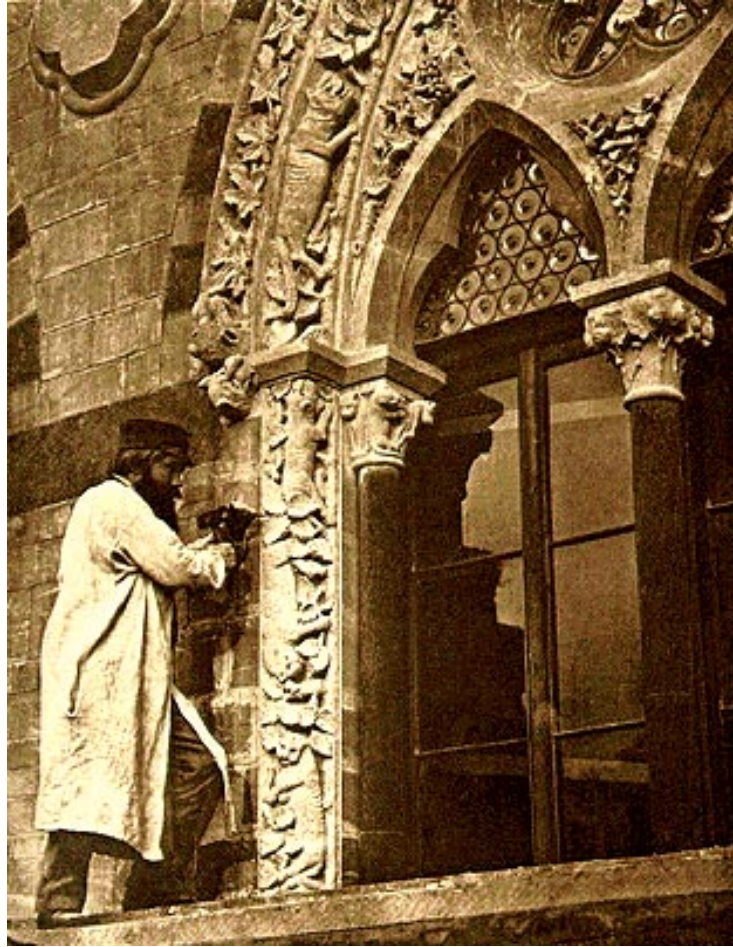
Figure 6: Photograph by Hills and Saunders of The Sculptor O'Shea at Work on a Window of the Oxford Museum , 1858. Courtesy of the Victorian Web , at http://www.victorianweb.org/art/architecture/oxford/17.html