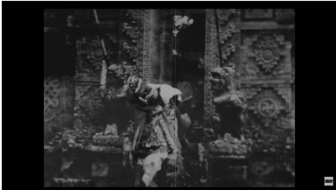
Figure 3: The Pandung attacking Rangda. 35

Rangda reaches the middle of the stage. The cycle in one gongan should end on note dong . 32 According to the Hindu religious concept in Bali, the note dong is the note related to the god Dewa Siwa (Bandem 1986, p 33). Dewi Durga, who is Dewa Siwa's sakti , 33 manifests her power as Rangda. 34 Given these considerations, a more appropriate choice for the soundtrack at this point would have been gending Malpal from Tunjang Durga , rather than Calonarang Tunjang (Figure 4).