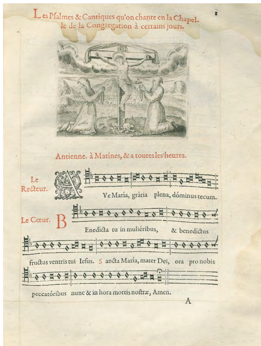
Fig. 1. First page of the musical encart by Le Roy & Ballard with the section title, an engraving, and the antiphon “Ave Maria” which opens the Hours of the Virgin. Quebec City, Musée de l’Amérique francophone, 22.7.8 QMUC.