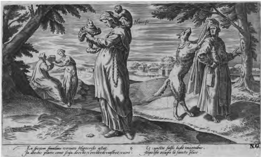
Figure 6. Hypocrisy Replacing Piety. Collection Rijksmuseum, Amsterdam