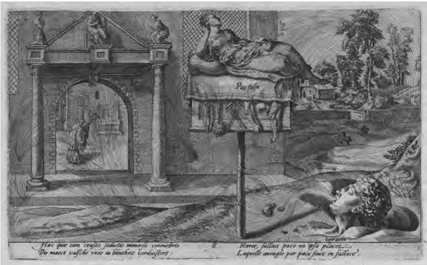
Figure 8. Ignorance Concealing the Falsehood of Peace. Collection Rijksmuseum, Amsterdam