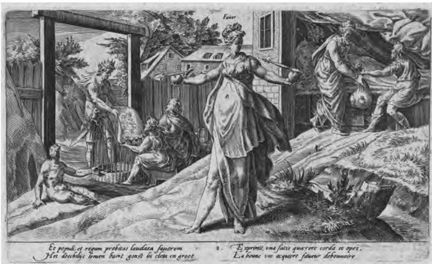
Figure 2. Man Rewarded for his Piety . Collection Rijksmuseum, Amsterdam