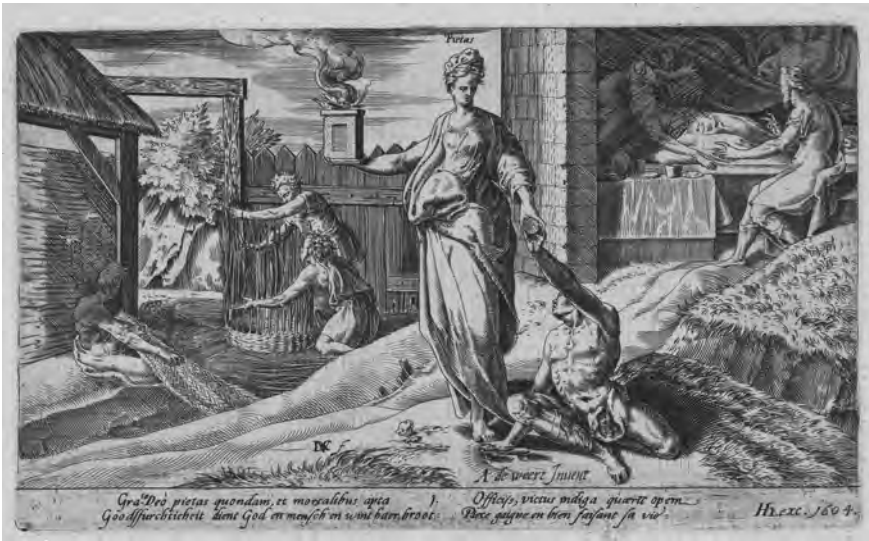
Figure 1. Man Piously Doing his Duty . Collection Rijksmuseum, Amsterdam