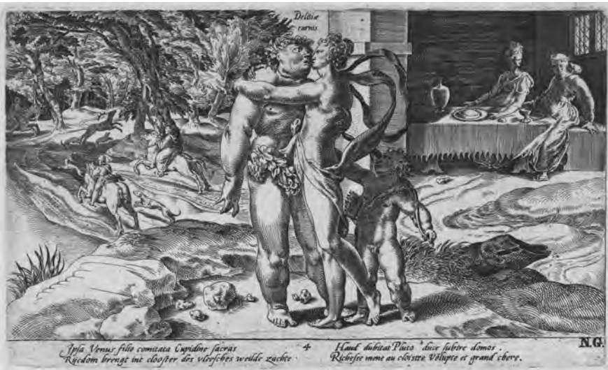
Figure 4. Wealth Bringing Sex and Alcohol into the Cloisters . Collection Rijksmuseum, Amsterdam