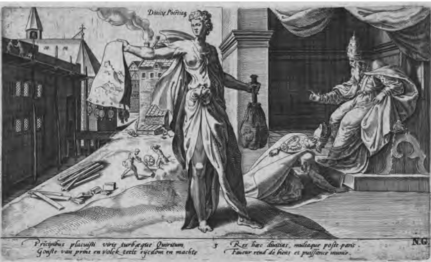
Figure 3. Wealth and Power Making their Entry into Society . Collection Rijksmuseum, Amsterdam