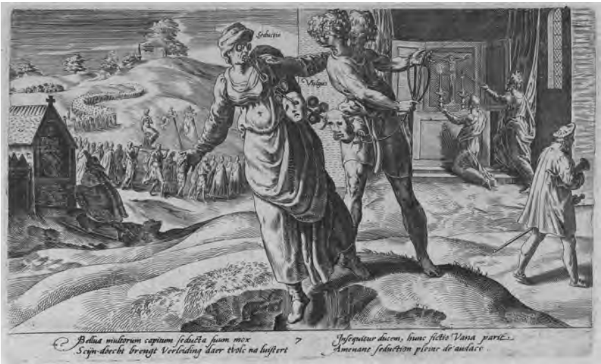
Figure 7. Deceit Bringing the People to Ruin. Collection Rijksmuseum, Amsterdam