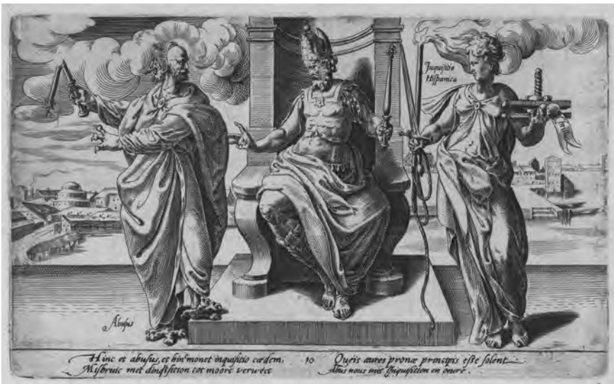
Figure 10. Corrupt Rulers and the Spanish Inquisition Committing Murder.