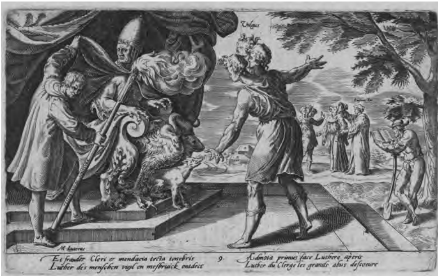
Figure 9. Martin Luther Revealing the Deceit of the Catholic Clergy. Collection Rijksmuseum, Amsterdam