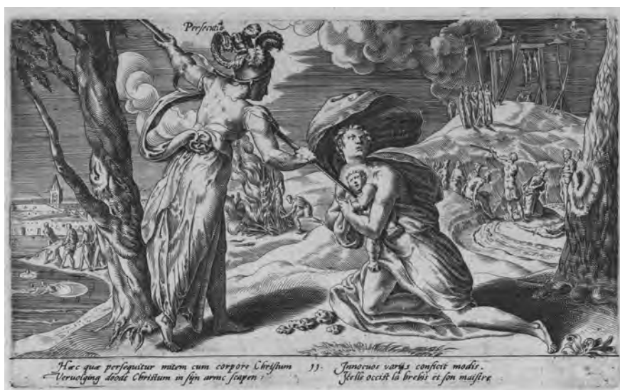
Figure 11. Innocent Christians Persecuted . Collection Rijksmuseum, Amsterdam