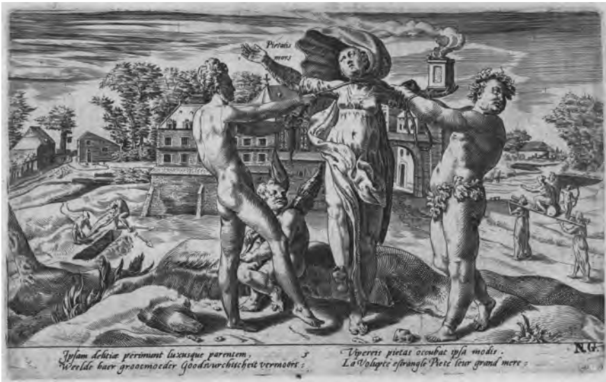
Figure 5. Sex and Alcohol Strangling Piety. Collection Rijksmuseum, Amsterdam