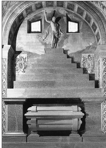
Illustration 5. Giulio Romano, tomb of Baldassare Castiglione, church of Santa Maria delle Grazie, Mantua, 1530s.