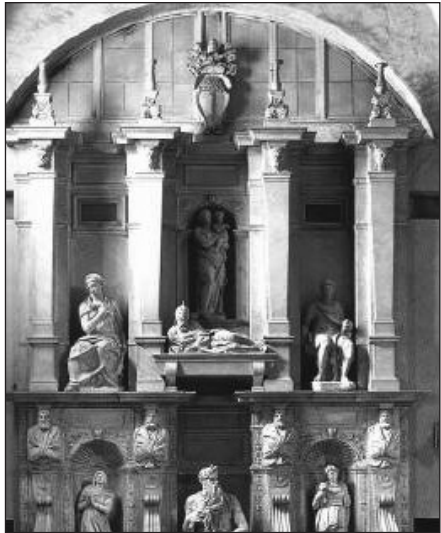
Illustration 2. Michelangelo, Tomb of Julius II, Church of San Pietro in Vincoli, Rome, c1545.