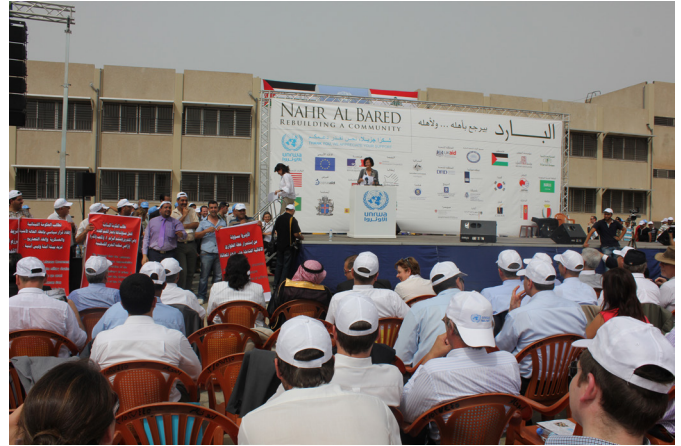
Figure 5. Nahr al-Bared inaugural ceremony (Package 1), 2011

Despite completion of the first reconstruction package, the residents were fed up with the living conditions in the camp and suffered from stress, frustration, and anger. In mid-June 2012 a new round of protests broke out in the camp. At one army checkpoint, a quarrel over entry permits led to army guards killing a fifteen-year-old boy. 87 With the camp's cemetery already filled beyond capacity, burial was impossible within the confines of the camp. The next day the victim's body was taken for burial on a piece of land owned by the PLO but controlled by the army. When the army intervened to stop the burial, fighting broke out and the soldiers on duty, claiming to be under attack, fired into the crowd, killing two and injuring twenty. 88 These incidents sparked countrywide protests and provoked clashes, strikes, and sit-ins in support of the victims. The situation in the Nahr al-Bared camp long remained tense, with the army claiming that it had been "infiltrated" by pro-Syrian elements