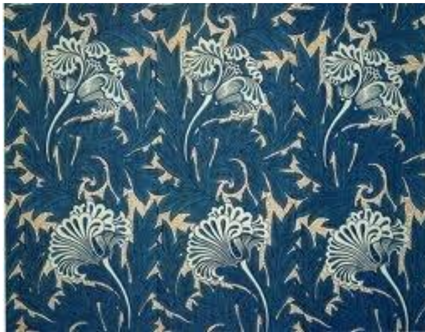
Fig. 4: William Morris, “Corn Cockle”

What are all the little pieces of the pattern doing, pushing and pulling against each other? 9 One feature common to many forms of panpsychism, both Victorian and contemporary, is a syndrome one philosopher has called “smallism” (Coleman, 40-44). Smallism is the tendency to assume that truth resides in the smallest particulars of reality. The tiny units or bits of miniature or “low”