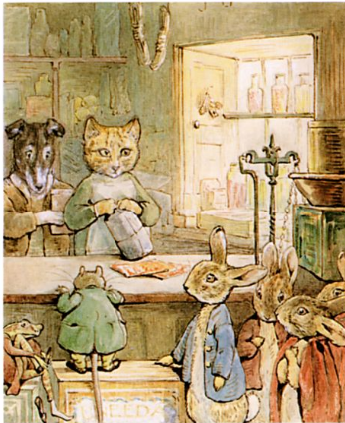
Fig 1: illustration from Ginger and Pickles

properties flow from a thing's essence, which itself hails from a remoter concept of being. In Butler's version of panpsychism, she says, "desire binds you to the wheel of life. Desire shapes your destiny for you within the wheel" (332). It may be appealing to our sense of individuality and free will, perhaps, to imagine a world in which everything makes itself from the inside out—babies their eyelashes, cats their fur, hens their feathers—but it is not so. It is of course as whimsical to imagine babies, hens, and cats buying their properties at an ontological bazaar as it is to imagine them making them: it sounds like a twisted, cosmic version of a story by Sinclair's contemporary, Beatrix Potter.