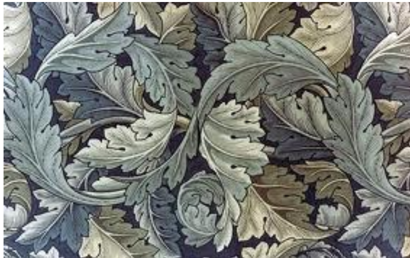
Fig. 5: William Morris, “Acanthus.”