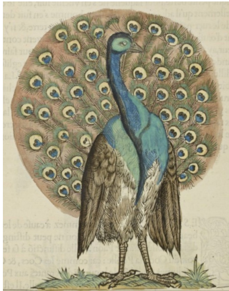
Figure 2. Pierre Belon, Hand-colored woodcut . In Belon, L'Histoire de la nature des oyseaux , Paris, Guillaume Cavellat, 1555, p. 234. This image comes from the copy of L'Histoire available online through Gallica ( https://gallica.bnf.fr/ark:/12148/btv1b8608302w/f268.item# ). A similar hand-coloured woodcut from the same edition of Belon's work is available online through the Bibliothèque municipale de Lyon ( https://gallica.bnf.fr/ark:/12148/btv1b8608302w/f268.item ).

was padded out with a few particulars (Cherchi 213–17). The novelty of his ideas forced Plato to utter “parole dure e fittitie” (“hard and specious words”), Gualandi observed, “una certa spetie imaginaria, difficile a trattarne, oltre che qui ne anche si richiede” (“imaginary concepts, difficult to discuss, and not even pertinent here”); cyathus , he added, “quasi dire un bicchiere tondo” (“in our vernacular is a rotund glass, the kind we call a ‘buffoon’”; Gualandi 159). 3 Galileo would thus occupy the Platonic role, with his novel notions, difficult terminology, and gestures to the “cupitude” of the lunar surface; his opponents by implication would be involved in a vain search for clownish goblets associated with heavy drinking.