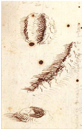
Figure 3. Galileo Galilei, Pen and ink drawings, detail . In Galileo, Ms. 50, fol. 68, Biblioteca Nazionale Centrale di Firenze. This image comes from the collection of Galileo's manuscripts made available online by the Biblioteca Nazionale Centrale di Firenze ( http://teca.bncf.firenze.sbn.it/ImageViewer/servlet/ImageViewer?idr=

Galileo also had access to the lengthy and well-illustrated discussion of the peacock published by the Bolognese naturalist Ulisse Aldrovandi in 1600. This account included every reference to several species of peafowl from antiquity through early modernity; of particular relevance here were its meticulous description of the bird's train, its paraphrase of Aelian's impression of the shivering noise so generated, and its careful analysis of the colour scheme of the eyes. These consisted of four concentric circles, Aldrovandi noted: the outermost was gold, the next reddish-brown, the third green, and the innermost caeruleus or sapphire-like, with the shape and size of a kidney bean (Aldrovandi 1–45, especially 11, 17). These details conform to Galileo's description and his sketch of the shadowed crater at the bottom of this image (see Figure 3). Aldrovandi's claim that even if the finest artists of antiquity—Praxiteles, Metrodorus, and the great Apelles—were brought back to life, they would be unable to match Nature in depicting the peacock's plumage, would have seemed at once an agreeable challenge and an elegant apology for any flaws in representation (Aldrovandi 5).