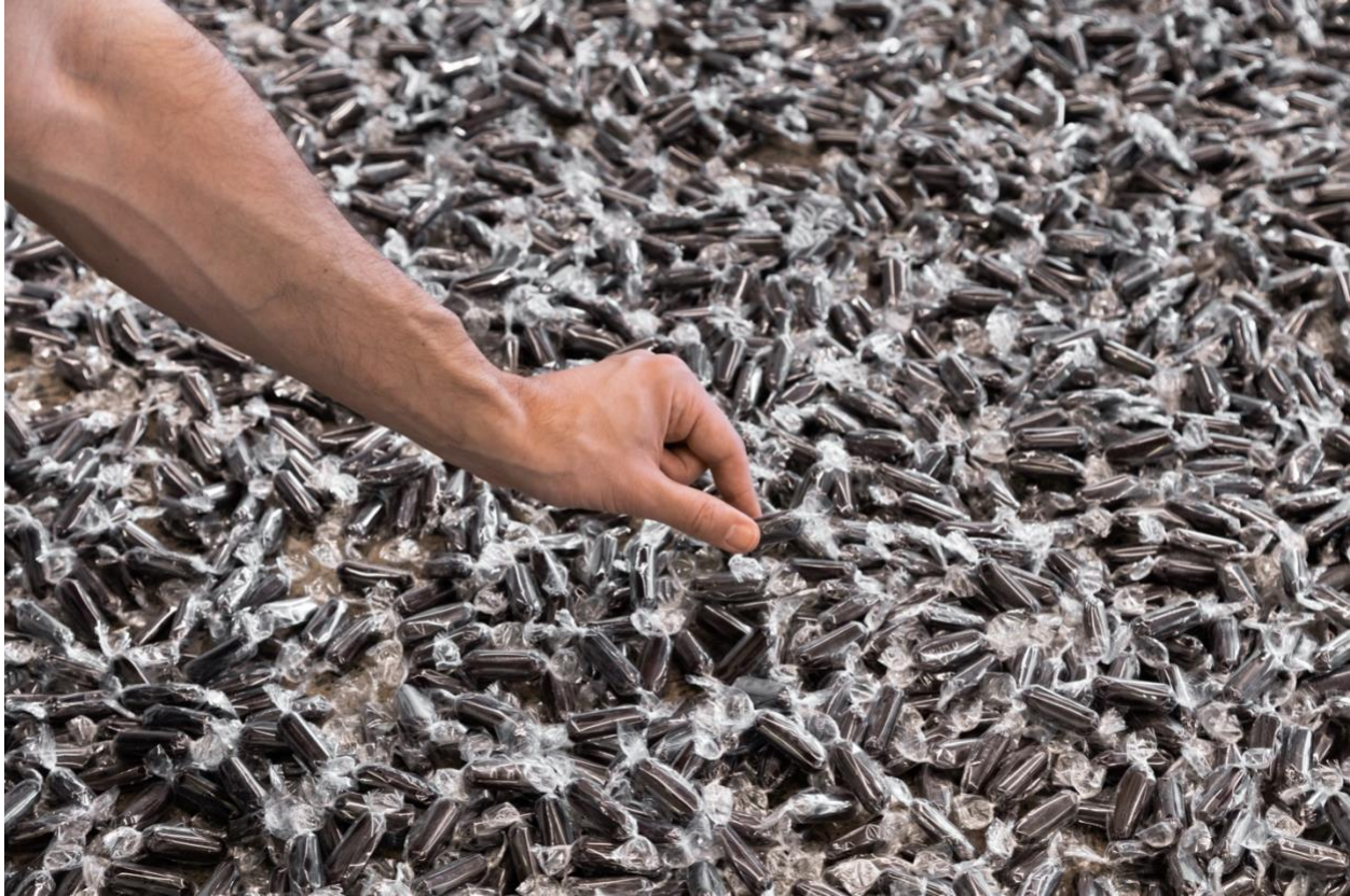
Felix Gonzalez-Torres, "Untitled" ( Public Opinion ), 1991, detail view, MOCA Toronto. Copyright Felix Gonzalez-Torres Foundation. Courtesy of MOCA Toronto. Photo: Laura Findlay.

LMC. I'm so fascinated by the tension that might lie within the works. For example, what might it mean by having "Untitled" ( North ) and "Untitled" ( Public Opinion ) in the same sightline or having both Summer and Winter as iterations of the exhibition. When I was visiting here in May, I also noticed a theme or maybe a tension between light and dark in the show. I'm thinking about how "Untitled" ( Golden ) refracts natural light and has its own metallic glimmer or how "Untitled" ( North ) harnesses electricity and emits light itself. Even "Untitled" 1989 has a reflective sheen to it. Then, you pair that luminosity with "Untitled" ( Public Opinion ) and "Untitled" ( Shield ). While these pieces have a sparkling quality due to their plastic wrap, they are the two pieces that aren't inherently metallic or luminescent—"Untitled" ( Public Opinion )'s onyx-like candy base and "Untitled" ( Shield )'s matte finish, where even the beige background appears a bit more dull in contrast with the stark white museum walls. Perhaps, in contrast with the other pieces, these two pieces are a bit darker in hue and maybe even in affective tonality.