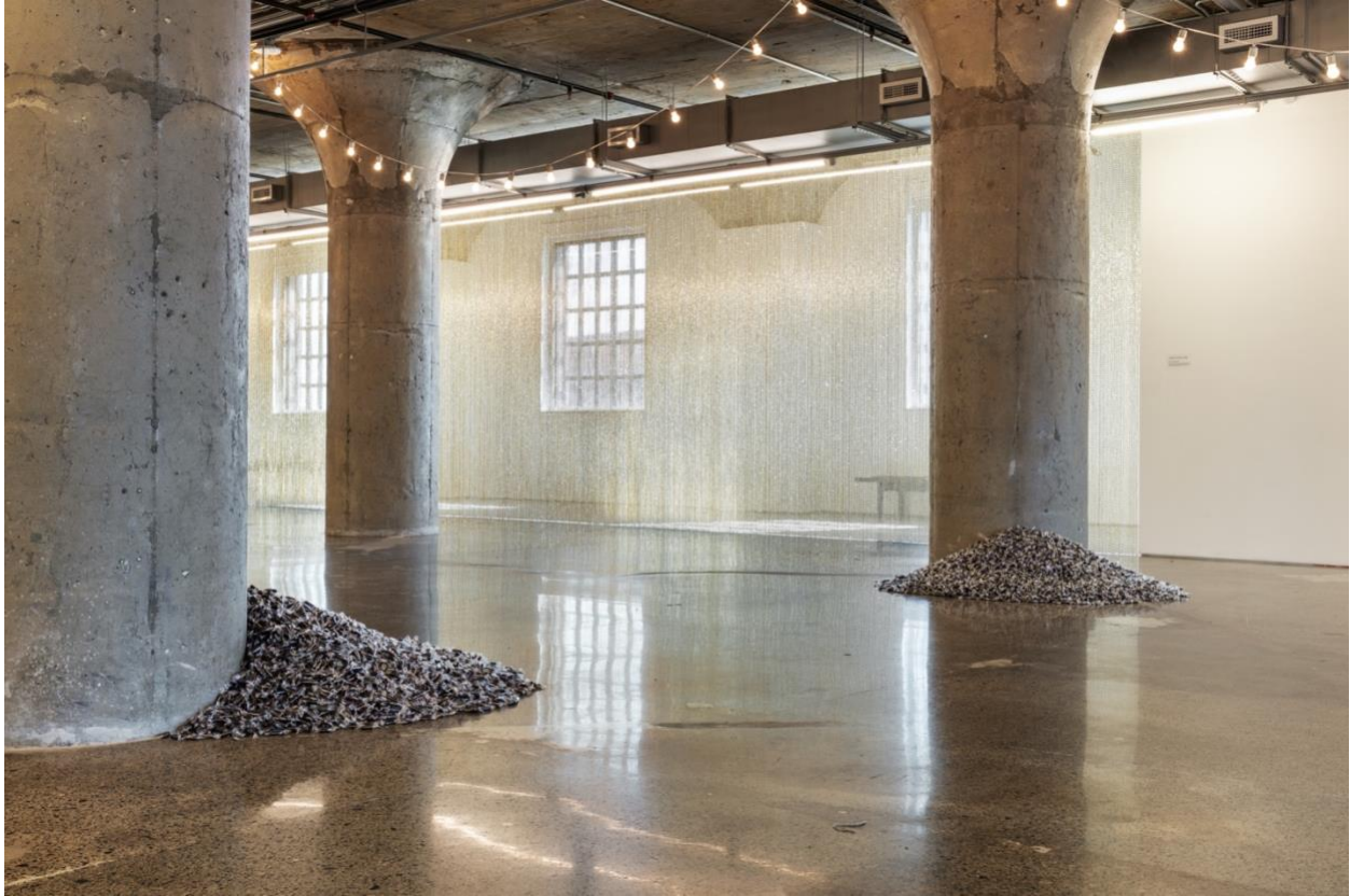
Felix Gonzalez-Torres, Winter, installation view, MOCA Toronto.