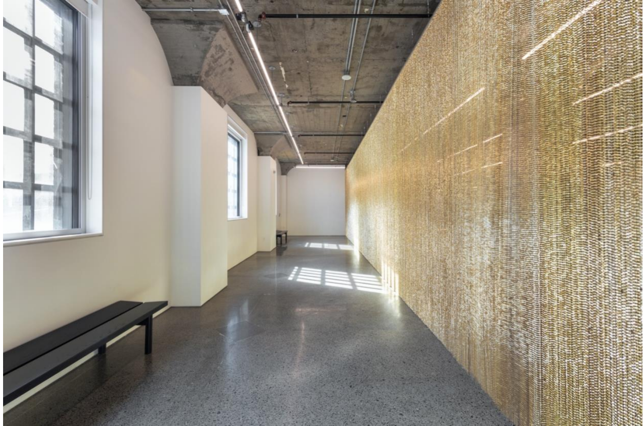
Felix Gonzalez-Torres, “Untitled” (Golden), 1995, installation view, MOCA Toronto. Copyright Felix Gonzalez-Torres Foundation. Courtesy of MOCA Toronto.