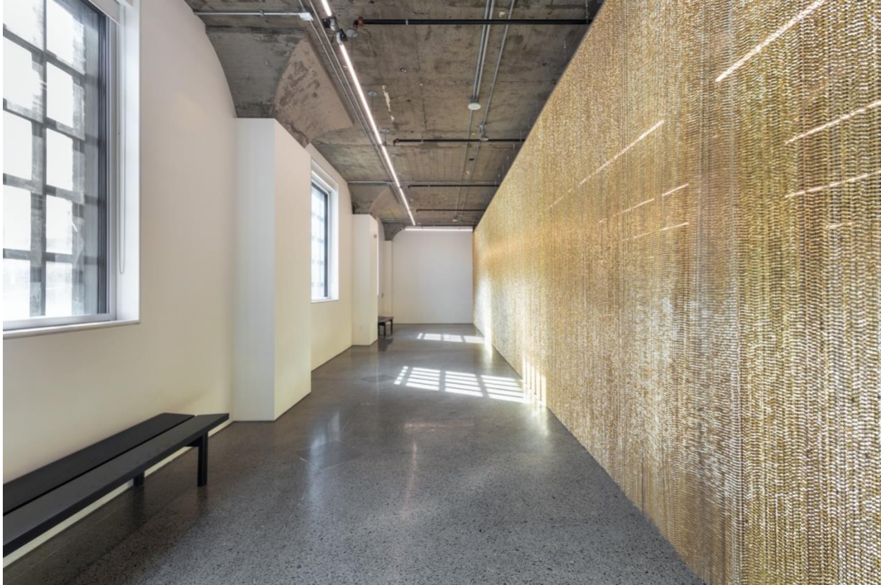
Felix Gonzalez-Torres, “Untitled” (Golden), 1995, installation view, MOCA Toronto.