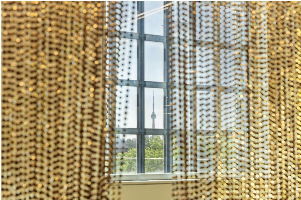
Felix Gonzalez-Torres, “ Untitled (Golden) ”, 1995, detail view, MOCA Toronto. Copyright Felix Gonzalez-Torres Foundation.

LMC. In these pieces that blur the public and the private, communal and individual feeling, I wonder what belongs just to Felix and what belongs to the spectator, and as a curator, in organizing and curating the show, what might you want from the spectator for Felix?