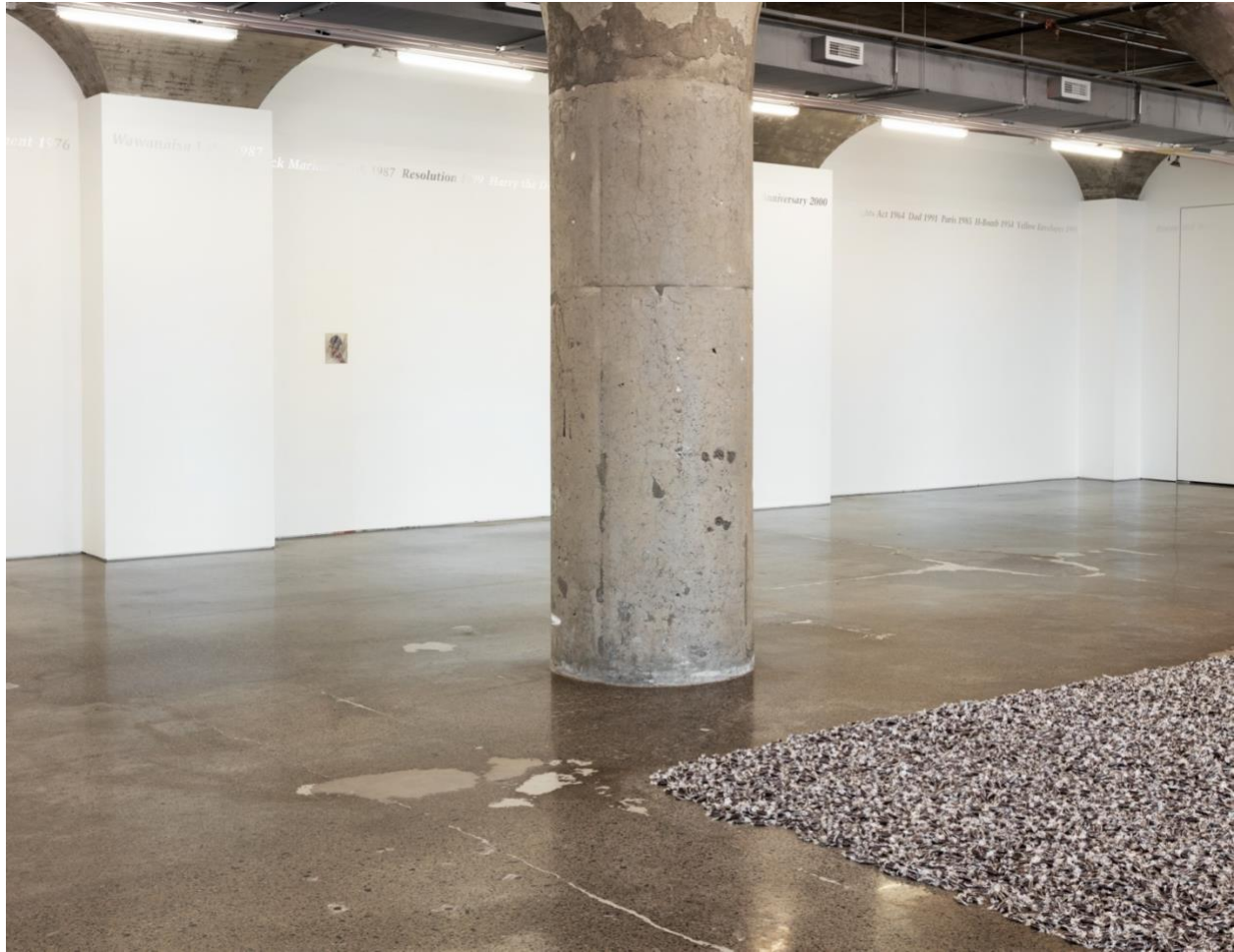
Felix Gonzalez-Torres, Summer , installation view, MOCA Toronto. Copyright Felix Gonzalez-Torres Foundation.

the light from the windows, the other pieces, and the above fluorescent fixtures reflect off the cellophane wrappers.