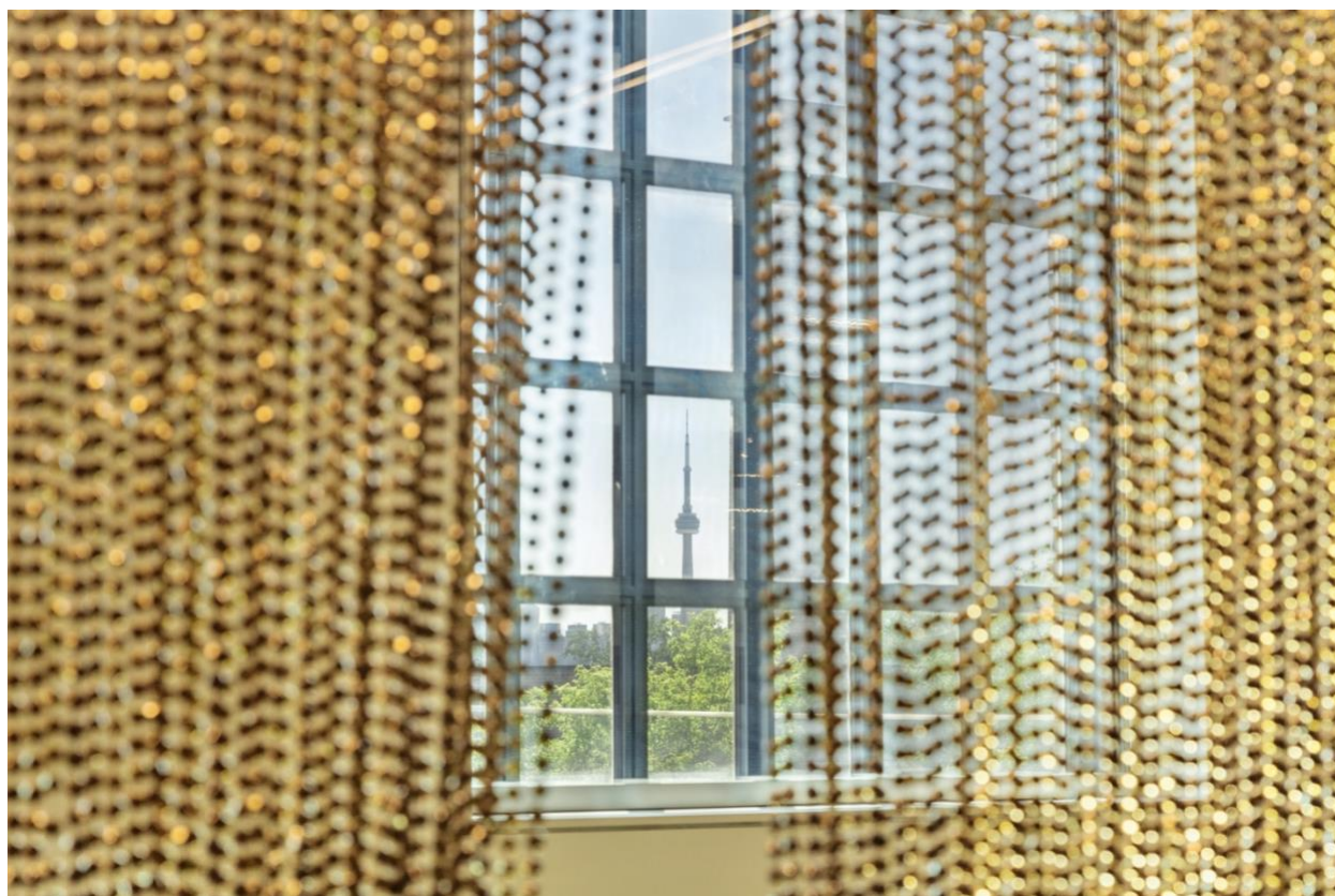
Felix Gonzalez-Torres, “ Untitled (Golden) ”, 1995, detail view, MOCA Toronto. Copyright Felix Gonzalez-Torres Foundation.

LMC. In these pieces that blur the public and the private, communal and individual feeling, I wonder what belongs just to Felix and what belongs to the spectator, and as a curator, in organizing and curating the show, what might you want from the spectator for Felix?