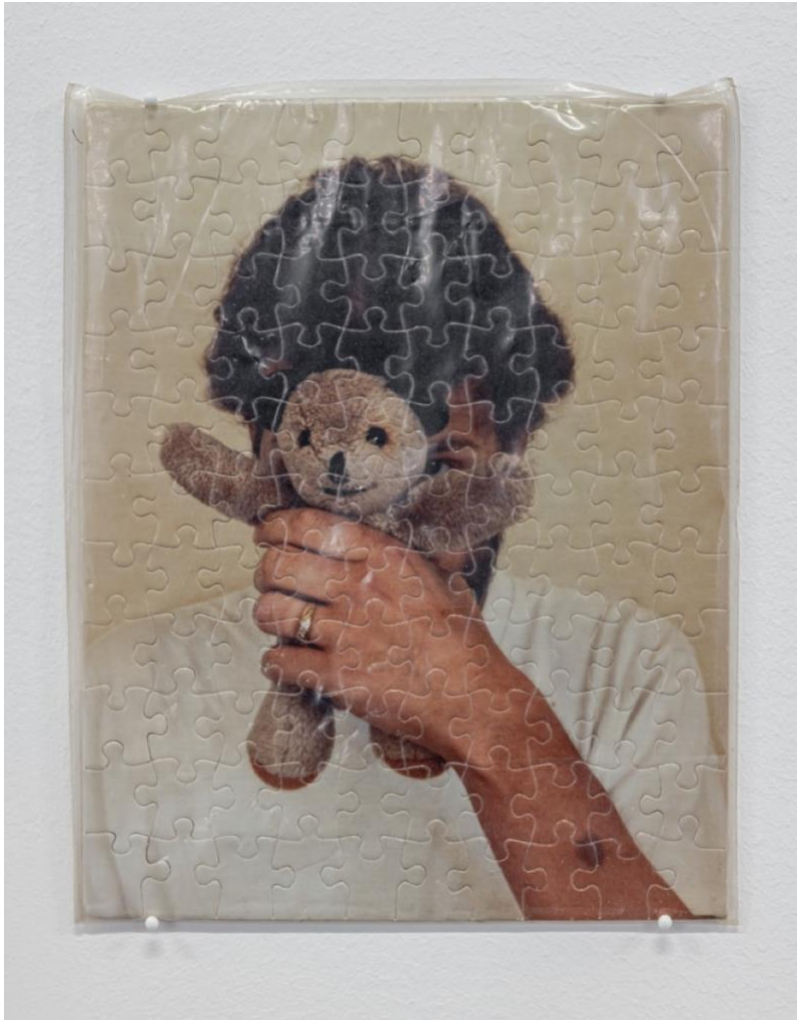
Felix Gonzalez-Torres, "Untitled" (Shield), 1990, installation view, MOCA Toronto. Copyright Felix Gonzalez-Torres Foundation.

LMC. Something you said during our first meeting really stuck with me: that death and grief can be life-affirming. Not only do I understand that personally, but that's so touching with regard to Felix's work. How might the phrase that death and grief can be life-affirming help us negotiate the presence of such deep loss in his work?