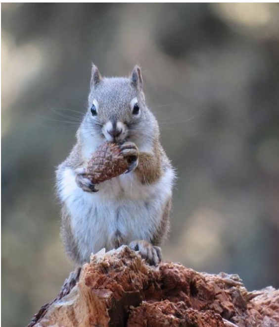
Red Squirrel ( Tamiasciurus hudsonicus ).

Just as children in ELM's program do, our creative team took a hike in Edmonton's downtown river valley (the largest urban park in Canada) to gather experiential information. The actors delighted in watching red squirrels ( Tamiasciurus hudsonicus ) scabble through the forest leaf litter, searching for a delicious snack, and sometimes bounding off carrying pinecones that looked to be as big as they were. In our city, pinecones are ubiquitous. There are long golden sticky ones; small, soft, ovoid ones; and a variety of sizes of hard, roundish ones. Since they contain numerous seeds, each one has multiple parts; they smell like forests; they are light in weight, and most fit easily into a child's hand. Squirrels collect and hoard, guard and steal, and messily munch pinecones, creating scatterings of pinecone debris in great piles of glorious mess. We collected dry, hard, rounded cones to play with in rehearsal.