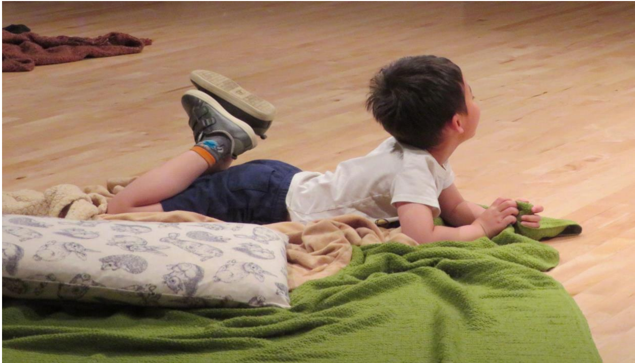
Participating through observing.

challenges our creative team to devise and think beyond the adult artists in a rehearsal hall, and thus centres very young children and their educators as co-researchers.