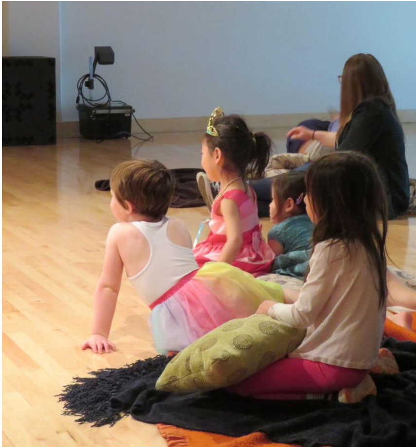
Cuddling in the nests.

As adult contributors to co-relationships, we have a responsibility to provide a rich environment for actors and children to play in. Our theatrical research environment operates similarly to a Flight -inspired classroom. We plan the immersive experience in terms of time, materials, space, and participation through play, and we consider children's meaning-making in order to make changes. Our physical setting tries to follow a Reggio Emilia approach, where the environment is viewed as a place that is welcoming, represents the local culture and communities, is aesthetically beautiful, embraces nature, and is filled with purposeful materials. Children thrive in environments that reflect their needs and interests and the layout of the environment nurtures children's well-being by being responsive to relationship building, communication, collaboration, and exploration through play. Our designers were mindful of these environmental attributes when creating the space and atmosphere for the young audience (e.g., pillows and blankets placed purposely on the floor, natural materials as props, nature soundscapes, etc.).