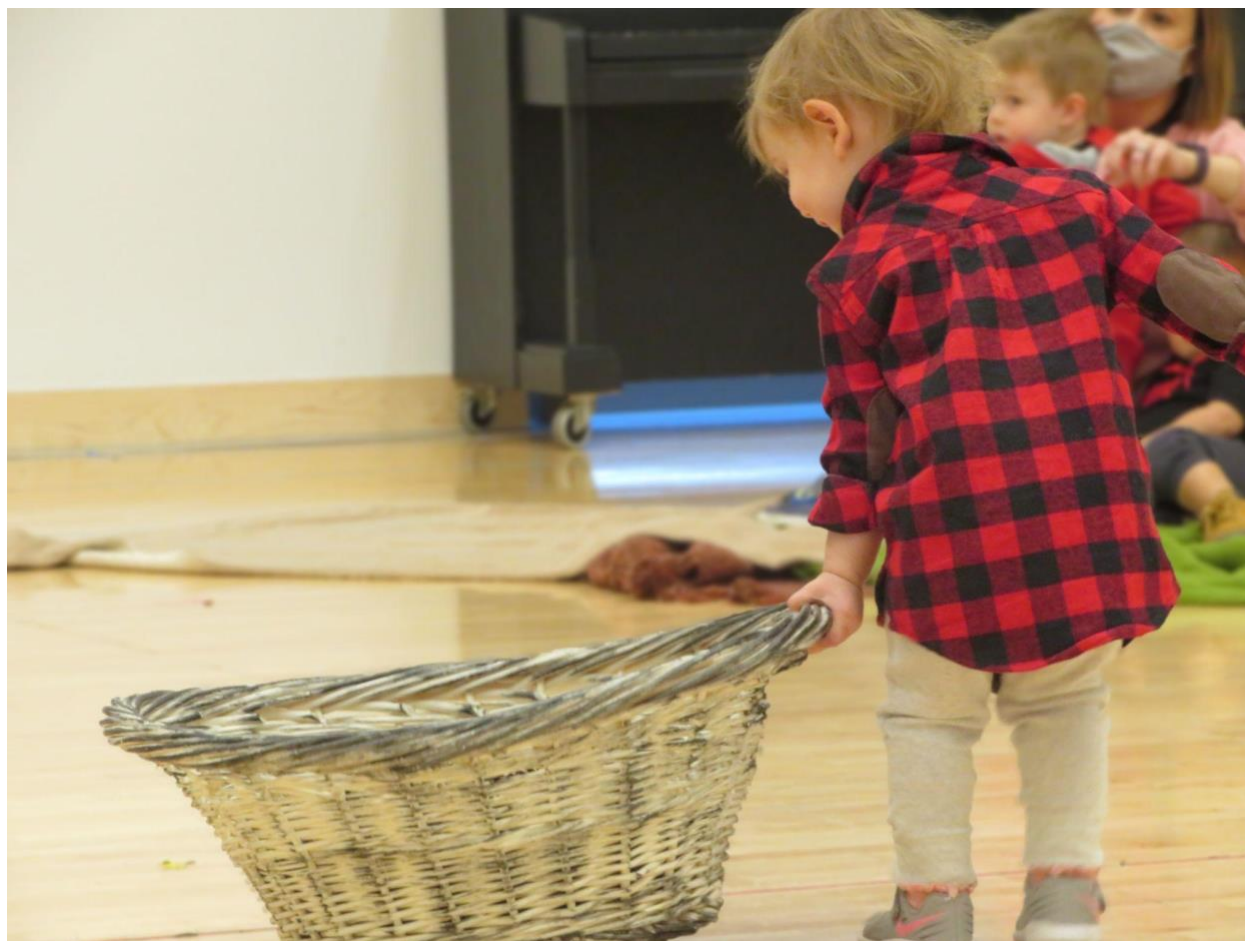
Stealing the basket.

We imagined that children would want to observe the action between the actors, or that they would want to co-create the narrative—and they did! Some observed, some engaged with pinecones, some engaged with actors, and some involved the educators. We presented this vignette three times, to three different age groups of children. Each time, the story was different, but the scaffold was the same. In the case of a group of four- and five-year-olds, most of the children watched the actors perform for nearly five minutes before participating. In the case of the two- and three-year-olds, as soon as the basket was shown, some children came forward and considered taking pinecones from the basket and began to follow the actors through their story. The youngest group of one- and two-year-olds included a number of children who watched the action at first, but also some who physically engaged immediately, either taking pinecones or trying to take the entire basket.