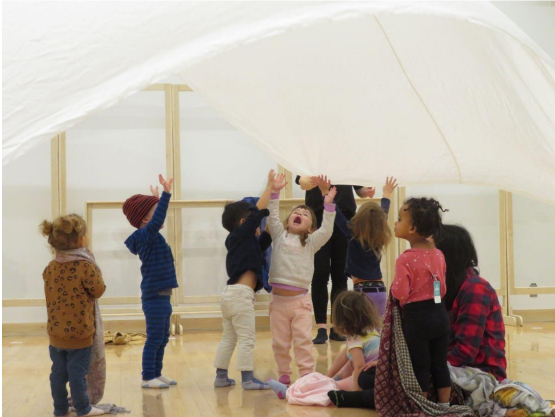
Silk snow magic.

opportunities, the immersive theatrical experience is intended for each child as they are today rather than who they become in the near or distant future. 5