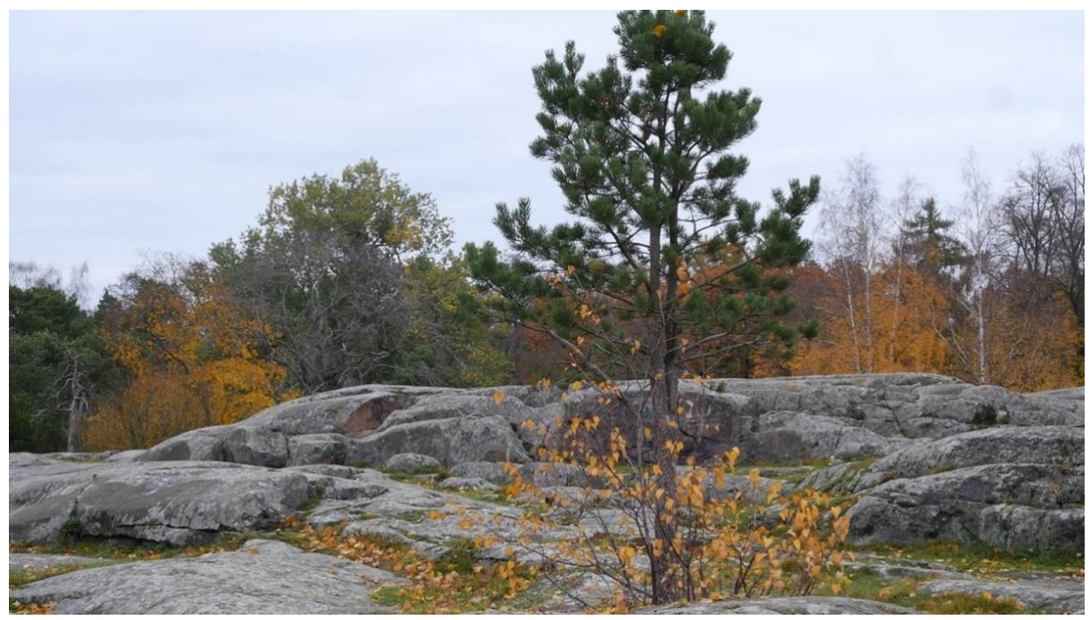
Video still, With a Pine I (2020).