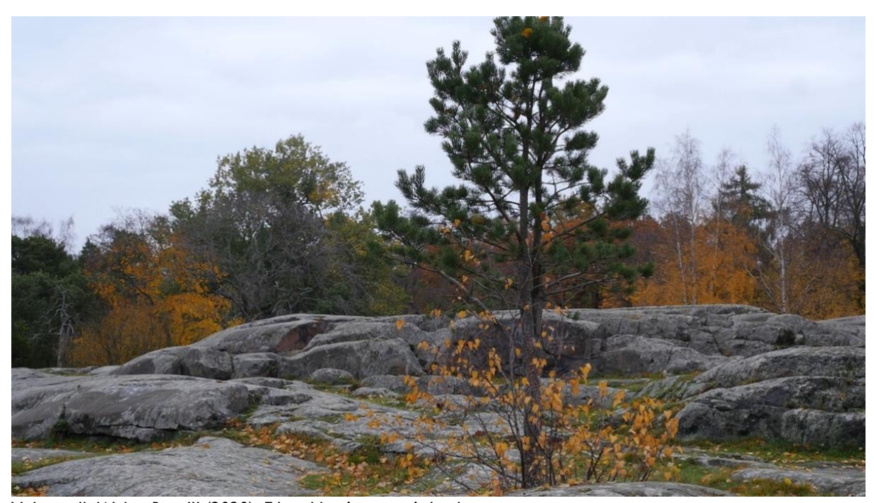
Video still, With a Pine III (2020).

The video essay is based on a compilation of three videos, <sup>13</sup> with my entering and exiting of the framed image excluded. The first version of the compilation, creating the appearance of one continuous performance, was rather long (54 minutes) and is here abbreviated to include only the beginning of all three letters on video. The recorded letters, however, are included in full, with each letter beginning synchronously with the image, and then assuming a rhythm of its own. The commentaries were added after each letter while the image still depicts the writing of that letter.