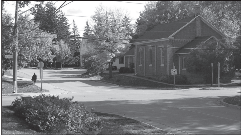
FIGURE 10. Looking southward along Second Line where it crosses Old Derry Road, in 2012. This might have been the intersection of two six-lane arterial roads. The 1863 Methodist Church stands on the southwest corner, with the 1871 village school (later, community hall) visible beyond.

routes to and from the rest of the city. Meadowvale has