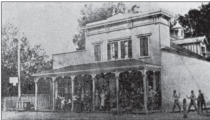
FIGURE 5. William Gooderham's store, about 1885. It burned in 1907. (Region of Peel Art Gallery, Museum, and Archives)

Methodist congregation and its pastor got a church building in 1863 (still in use in 2012), but never a cemetery; caskets went upstream to Churchville for burial. Teamsters took grain and flour along Centre Road (Hurontario Street) to Brampton for delivery to the Grand Trunk Railway, newly opened between Toronto and Stratford during 1856. All these activities, plus the increasing assort-