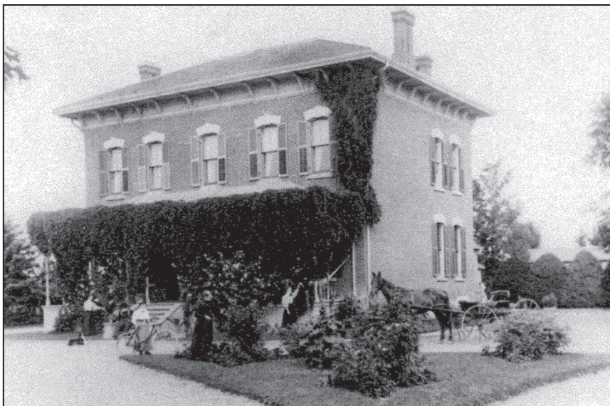
FIGURE 6. The Charles Gooderham Estate, about 1900. It is a private school in 2012.

Meadowvale picture in 1854, the year when the Silverthorn mill burned for a second time. He rebuilt again (a paternalistic response for which his work-