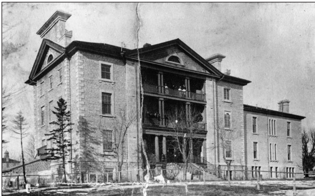
Kingston Hospital, 1861

maternity patients, nor the mentally ill because they were sent to the lying-in hospital or the asylum respectively. In Kingston, with neither an asylum nor lying-in facility, some mentally ill and maternity patients were admitted to hospital