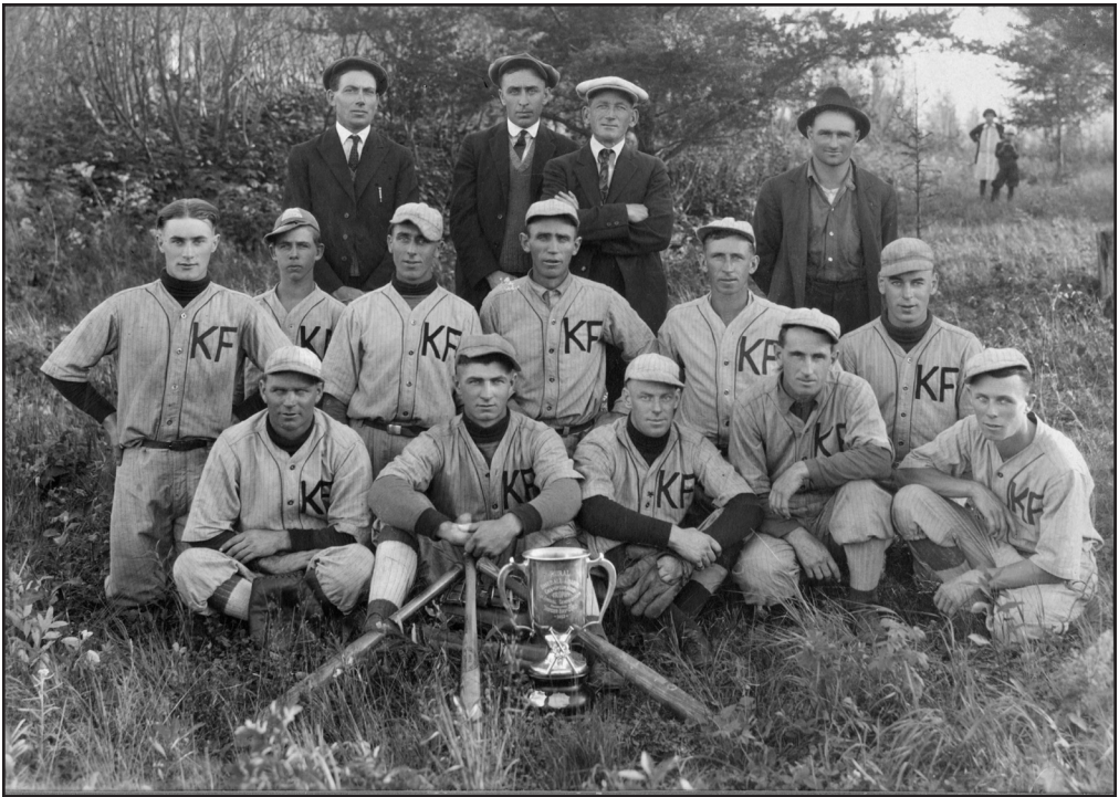
The team from Kakabeka Falls, Ontario, winners of the Rural Baseball League Championship trophy in 1913.

comradeship so yearned for by the young farmer, the absence of which often triggered a move to the city. 88