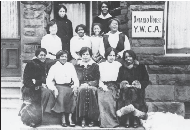
The next generation of African Canadians in Toronto carried on the tradition of activism. This Collingwood group is posing in front of the Toronto YWCA.

chicken and watermelon.” The woman responded that that was the most insulting thing he could say to someone of African origin. 53