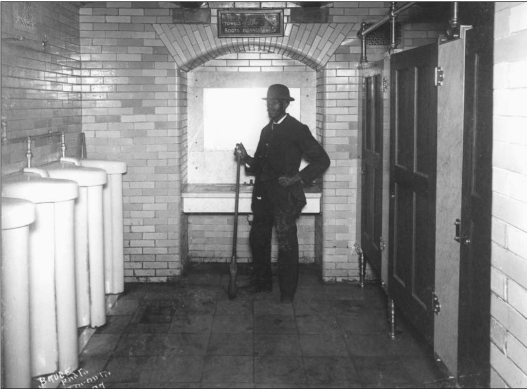
Blacks in Toronto in the 1880s were often confined to low-skill occupations in service-oriented jobs such as this public washroom attendant.