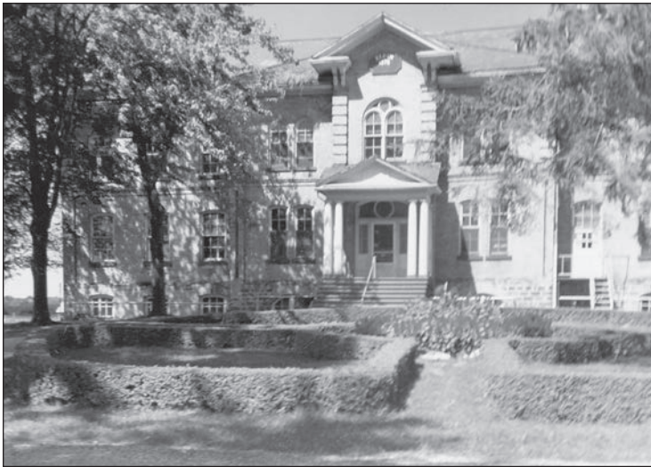
Elgin House of Industry, courtesy of Elgin County Archives

The Archives is the official repository of records of the County of Elgin since its incorporation in 1852 as well as those of its current and former constituent municipalities. The Archives also houses a number of private collections documenting the County's history and its citizens.