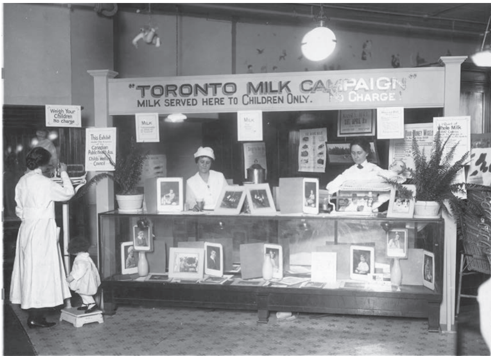
Nurses giving out free milk and weighing a child at a booth in the T. Eaton store as part of the Toronto milk campaign, 1921.

The timely arrangement and description of these