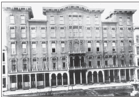
Wesleyan Ladies College building.

material from the school. There is a scrapbook dating from 1861 onwards containing such things as programmes, accounts, photographs, and clippings. The Alumnae Association Literary Club was an active group