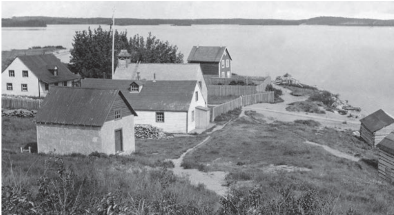
Osnaburgh House.