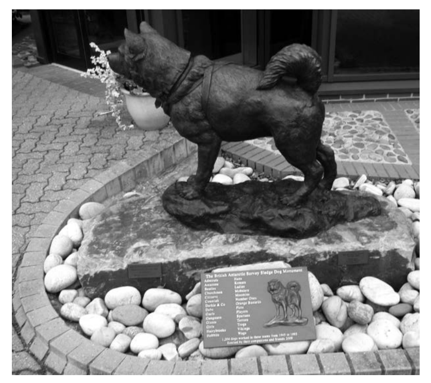
The husky memorial, Cambridge.

In memory of the valuable contribution made by all of the huskies to the operation of the British bases, a statue to them was unveiled on 4 July 2009 outside the British Antarctic Survey headquarters in Cambridge. It now resides in the grounds of the Scott Polar Research Institute, University of Cambridge.