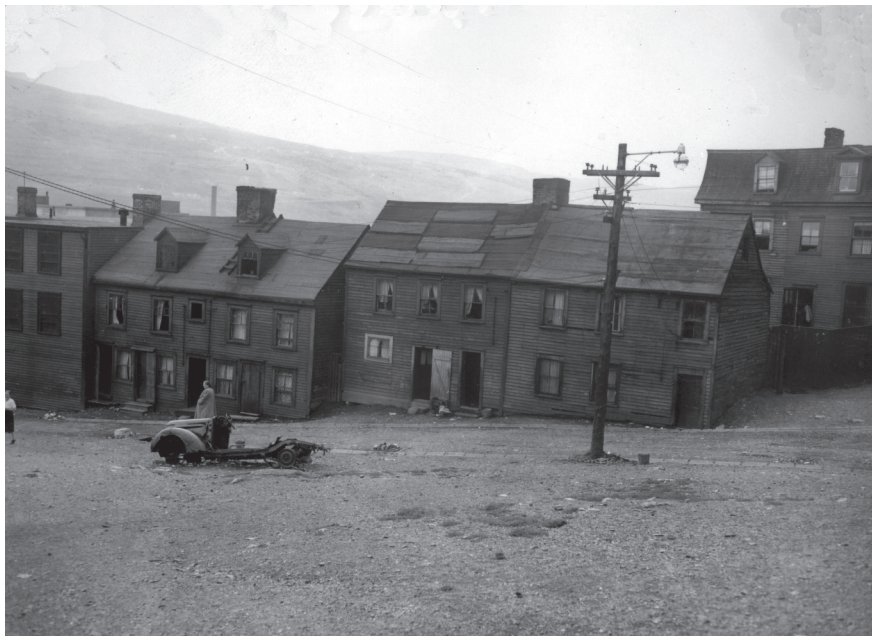
Photo 1: This undated photo shows a woman looking towards the Southside Hills from Cuddihy Street. The current St. John's City Hall is located near this area.