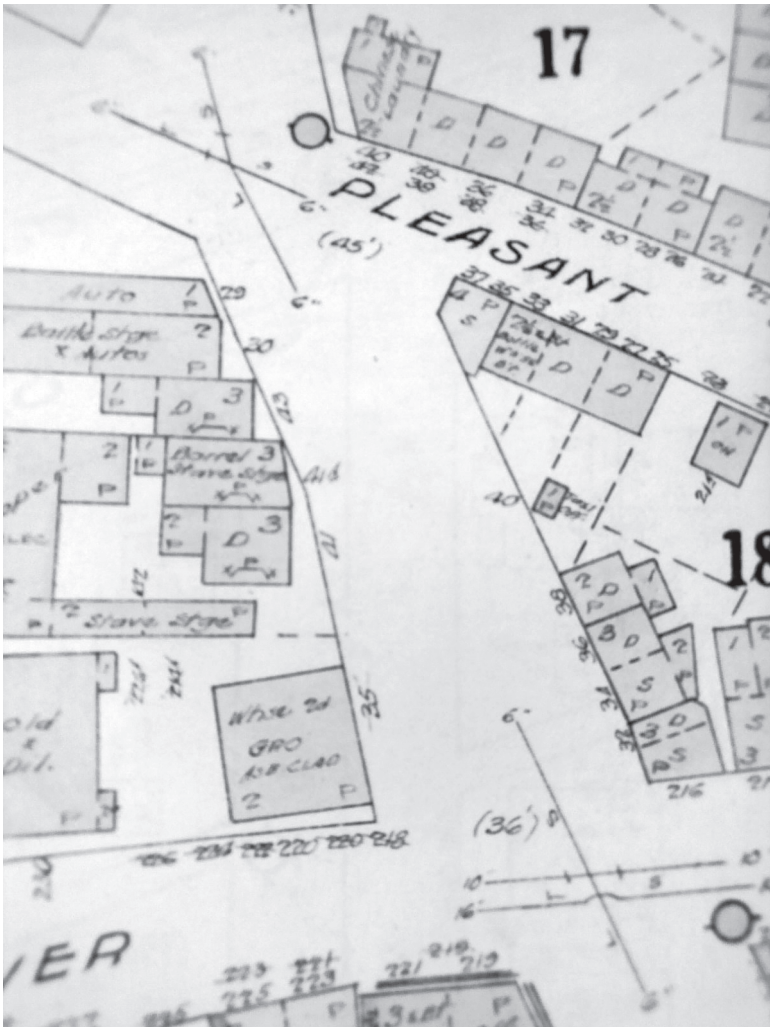
Map 3: This map shows the area depicted in Photo 3.

The need for subsidized and low-rent housing did not disappear with the slum clearance of the 1960s and the NIP and RRAP programs. In fact, Bacher (1993) argues that the latter had the ironic effect of inflating housing prices and further displacing low-income earners. And, as we have seen, the Cabot Place Development removed even more low-income earners from the little