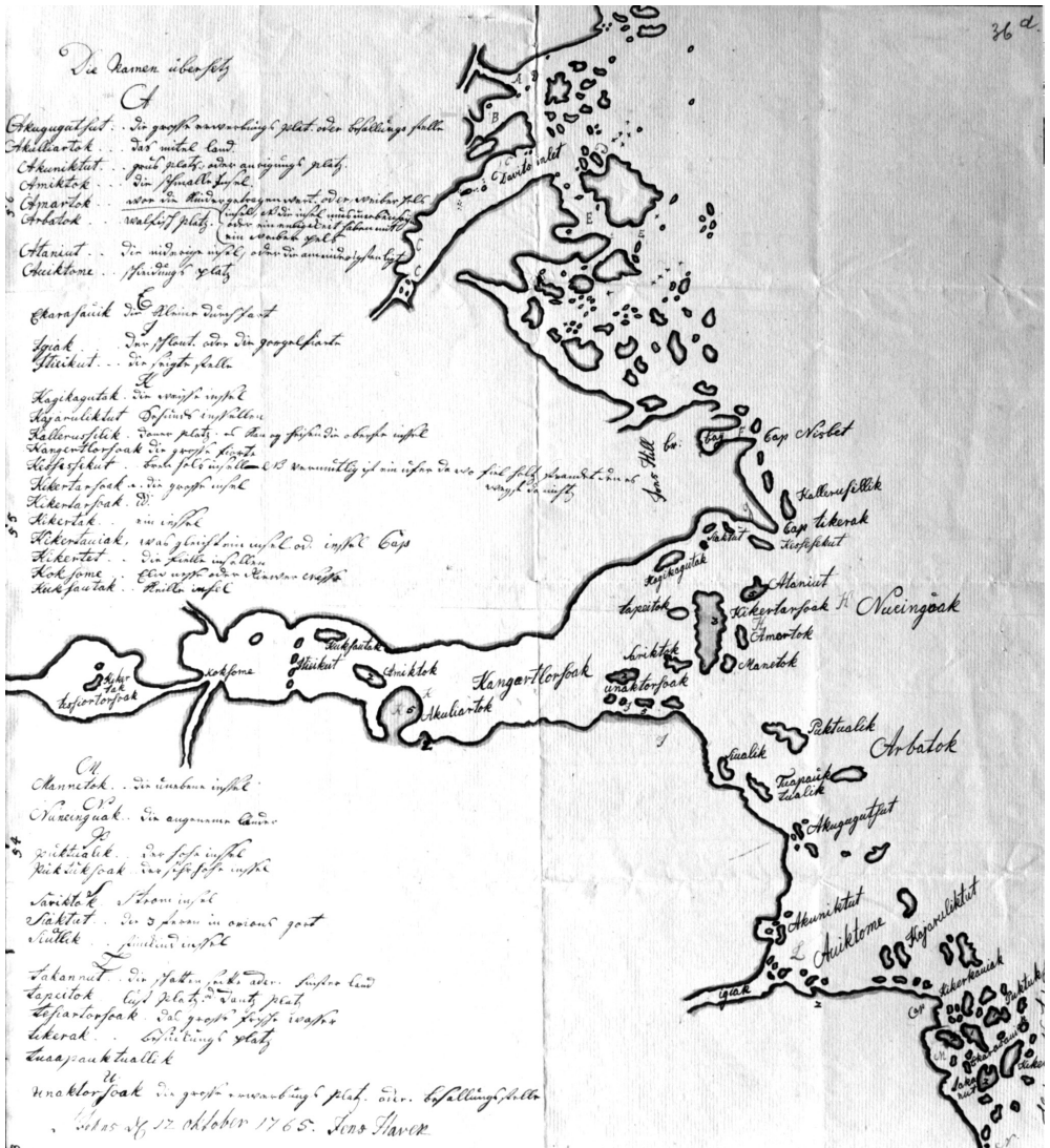
Figure 1: Haven-Schloezer map from 1765 (TS Mp.111.10).