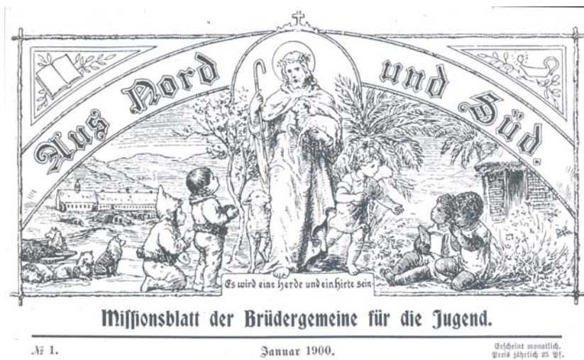
Cover nameplate of the Moravian children's magazine Aus Nord und Süd ; Unity Archives, Herrnhut.

served the Hebron Church. There he ministered when the devastating Spanish Influenza epidemic of 1918 ravaged the community. 2