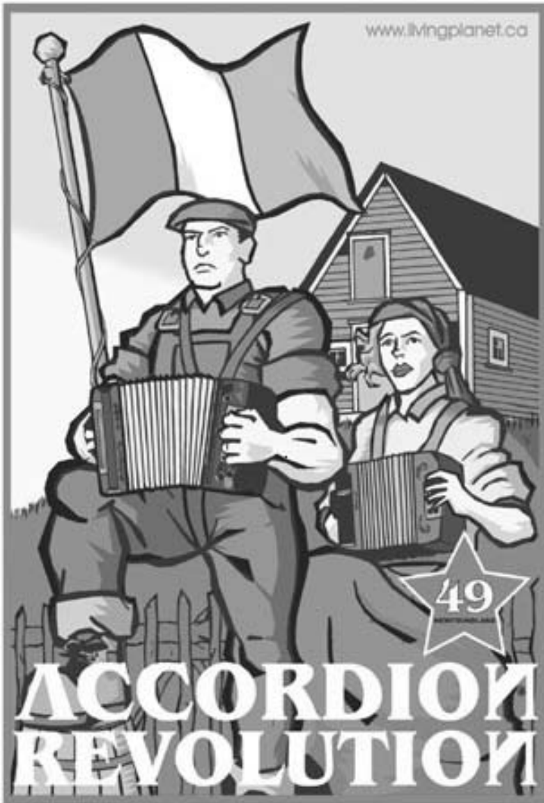
Figure 5. "Accordion Revolution" by Living Planet. Note the differences between this image and the images from the Dominion Ale songbooks. The concertinas have been replaced by traditional accordions, and the gap-toothed grins have disappeared in favour of this look of determination and purpose. It is hard to tell if the 49 in the star is a date of victory to be celebrated or a date of defeat to be avenged.