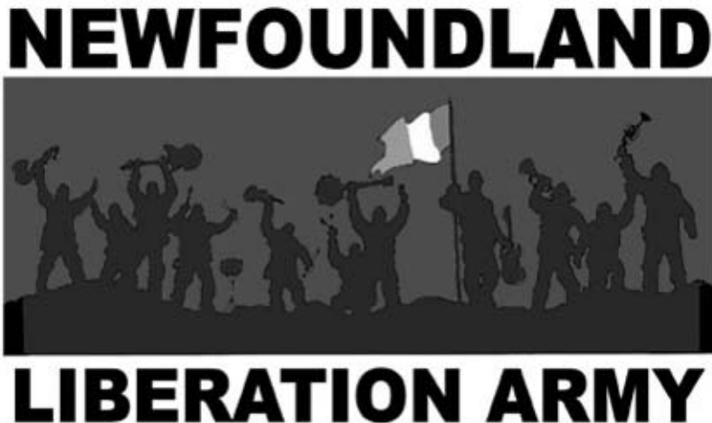
Figure 1. “Newfoundland Liberation Army” by Living Planet. Note how the instruments substitute for weapons in this “army”: fiddles, banjos, even spoons. Reproduced with permission of Living Planet.

Living Planet, a purveyor of patriotic garb in the St. John’s shopping district (also dubbed the “heritage district” by the Government of Newfoundland and Labrador) counts among its bestsellers a shirt which sports the name and logo of the “Newfoundland Liberation Army” (Figure 1). The design depicts eleven silhouetted figures cresting a horizon of blood red sky meeting rocky earth. In the spirit of Eugène Delacroix’s