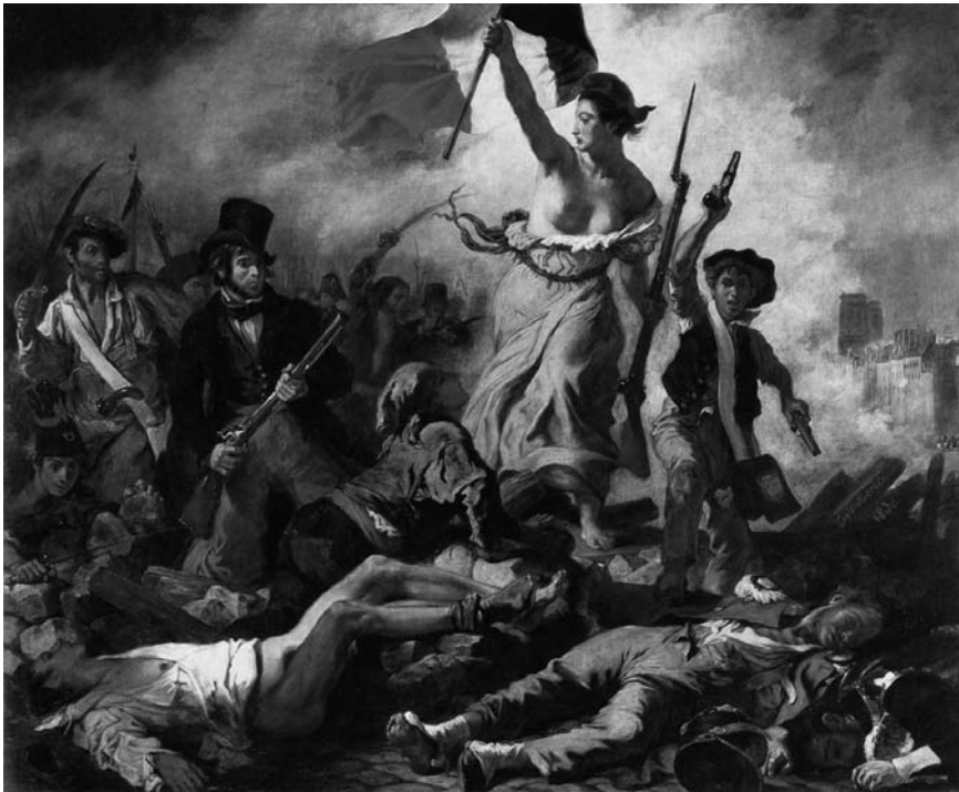
Figure 2. "Liberty Leading the People" by Eugène Delacroix. 1830. Undoubtedly one of the inspirations for the "NLA" logo. The tricolour is central, flanked by muskets, not instruments.

Liberty Leading the People (Figure 2), the leader of the pack carries the unfurled flag of the Republic — not the blue, white, and red of France, but the vertical pink, white, and green bars of the old Newfoundland flag. In Delacroix's painting, the feminine personification of liberty carries in her other hand a rifle with bayonet — the flag bearer of the Newfoundland Liberation Army carries a guitar. In the upraised arms of the other Newfoundland insurgents are saxophones, trumpets, banjos, and fiddles — one member of this musical mob proudly brandishes a set of spoons. The design is very much in the spirit of a "people's uprising" — a guerrilla force of singing Sandinistas bravely battling tyranny. Through this mixture of the militaristic and the musical one can sense that the arts have become the real weapon of independence on this island. Here the Newfoundland "come all ye" becomes a more forceful "Musicians of the island unite!" It is an image remarkably and no doubt purposefully similar to posters calling for violent revolution. The symbol has proven rather vogue, appearing not just on T-shirts, but on tight-fitting bellytops (for the sexy socialist), and retro-style three-quarter-length T-shirts à la the Mötley Crüe and Def Leppard shirts so popular in the 1980s. The shirt has become one of the province's biggest exports — favoured by trend-seekers and in-