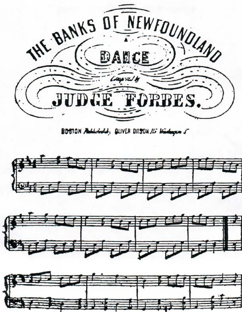
Example 1. Francis Forbes, The Banks of Newfoundland , mm. 1-12. 28

The Natives' Society held its first festival in July 1841, replete with speeches, toasts, and appropriate airs played by a military band (see Example 1). One of these