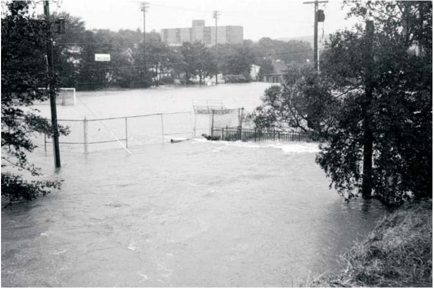
Figure 10. Floods cover soccer field at head of Quidi Vidi Lake, September 2001. Note footbridge over Rennie's River forming dam as it blocks flood waters.