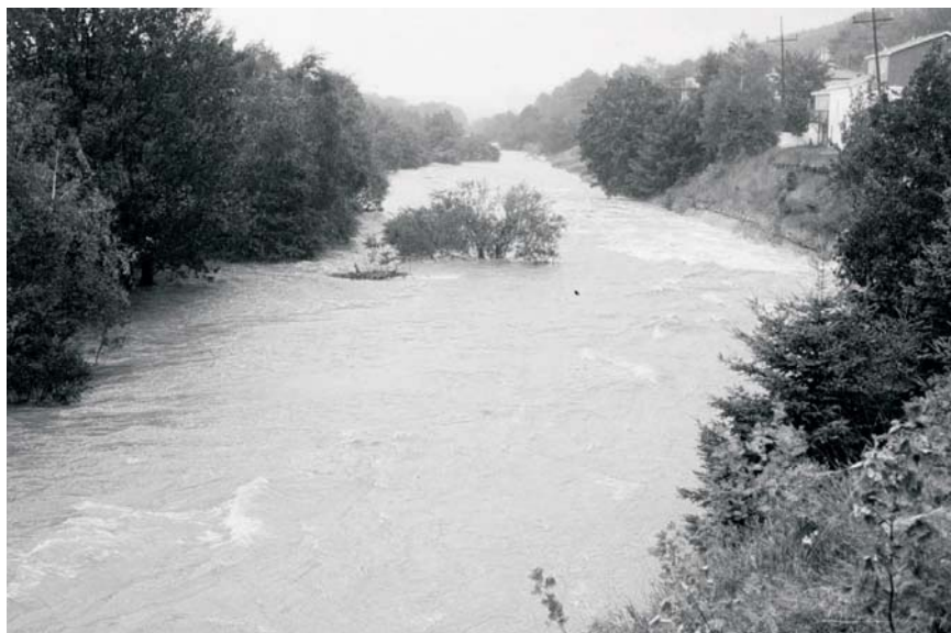
Figure 8a. The Waterford River in full flood, 19 September 2001.