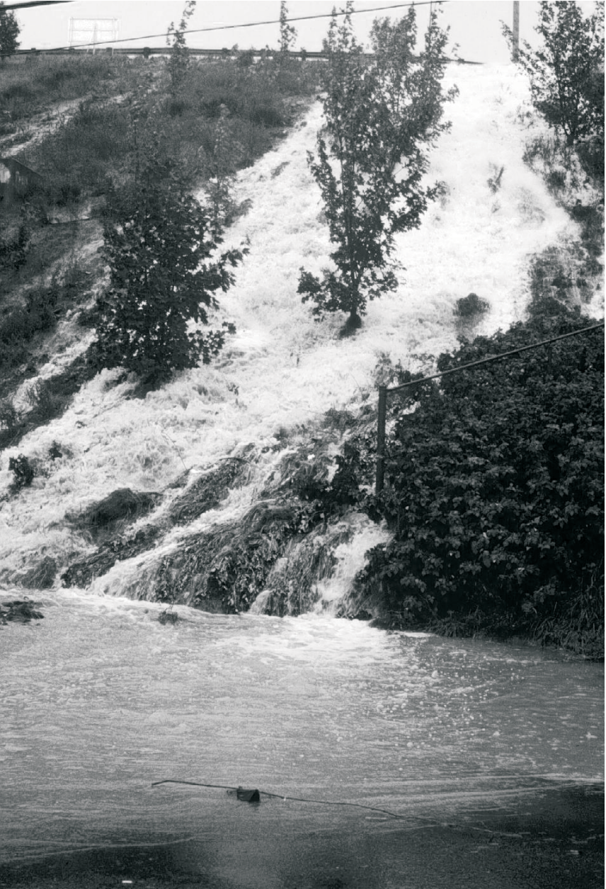
Figure 9. Waterfall created on Southside Road during September 2001 floods.