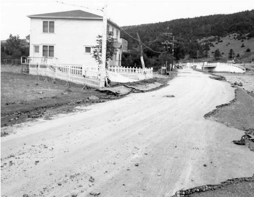
Figure 4. Flood damage on Southside Road, September 1948.

At least three families had to leave their houses because of the damage and were provided with temporary housing, though one family was later asked to leave, as the husband was in employment. In contrast to earlier incidents, there was discussion in the newspapers and in council about where the blame should lie, more