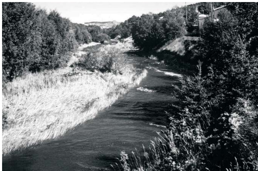
Figure 8b. Waterford River 24 hours later, showing effect of flood, and rapid return to normal water levels.