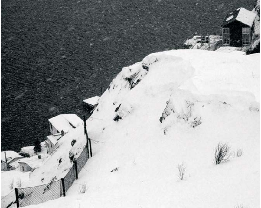
Figure 7. Protective fencing erected above the Outer Battery in 1998.