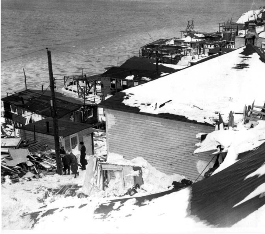
Figure 6. Aftermath of the 1959 Battery avalanche.