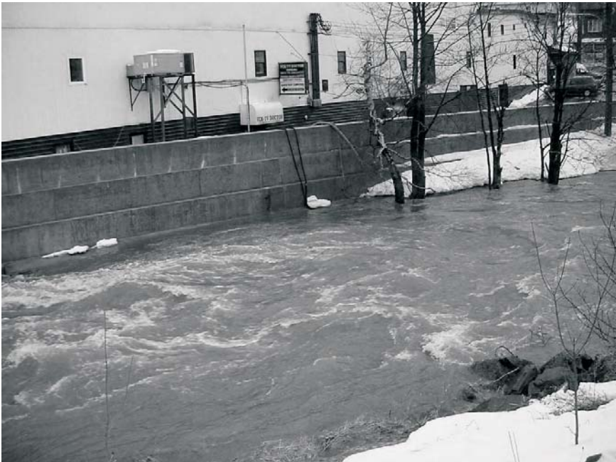
Figure 12. Flood protection, Waterford River, constructed after 2001 flood.

Following recent floods, there has been speculation that the city has become more vulnerable to flooding due to the increase in paved areas and the channelization of streams. Many small streams were confined to underground culverts during development, and, during the Gabrielle event of September 2001, much flooding occurred along such former stream channels as the culverts were unable to contain run-off. Open stream channels tend to be able to hold more water before bursting their banks onto flood plains. Development and urbanization results in wetlands and other natural areas that might hold water after heavy rainfall being paved over and turned into hard surfaces. Rain falling on such surfaces is rapidly transported into storm sewers and to the river systems. Thus the effects of a heavy rainfall event change significantly, with more water being supplied to the river systems over a shorter period. This results in higher, shorter duration flood events.