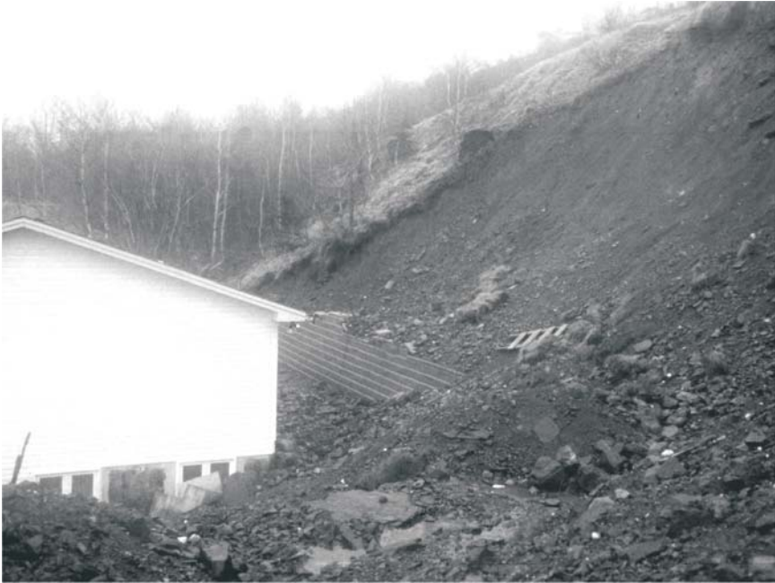
Figure 5. Recent construction on Southside Road, undercutting steep banks of till and increasing landslide hazard.

and the houses cling to a narrow strip between the cliffs above and the sea below. Although protected from the sea, and subject to a favourable microclimate, due to the south-facing aspect, the Battery is among the most hazardous places to live in St. John's. Archival and anecdotal evidence indicates that rockfall is frequent in this area, and that several avalanches from Signal Hill have occurred. In contrast, the north-facing, less steeply sloping Fort Amherst area has not been susceptible to avalanching.