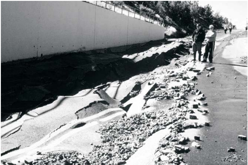
Figure 11. Flood damage on Shea Heights road, September 2001.