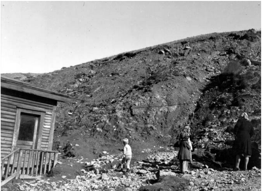
Figure 3. The scar left by the landslide of 15 September 1948 at 387 Southside Road.

Several other landslides occurred in the same storm, with three other houses damaged. The adjoining bungalow (number 389) belonged to the Clarke family, whose members were fortunate to escape without serious injury. The rear of the