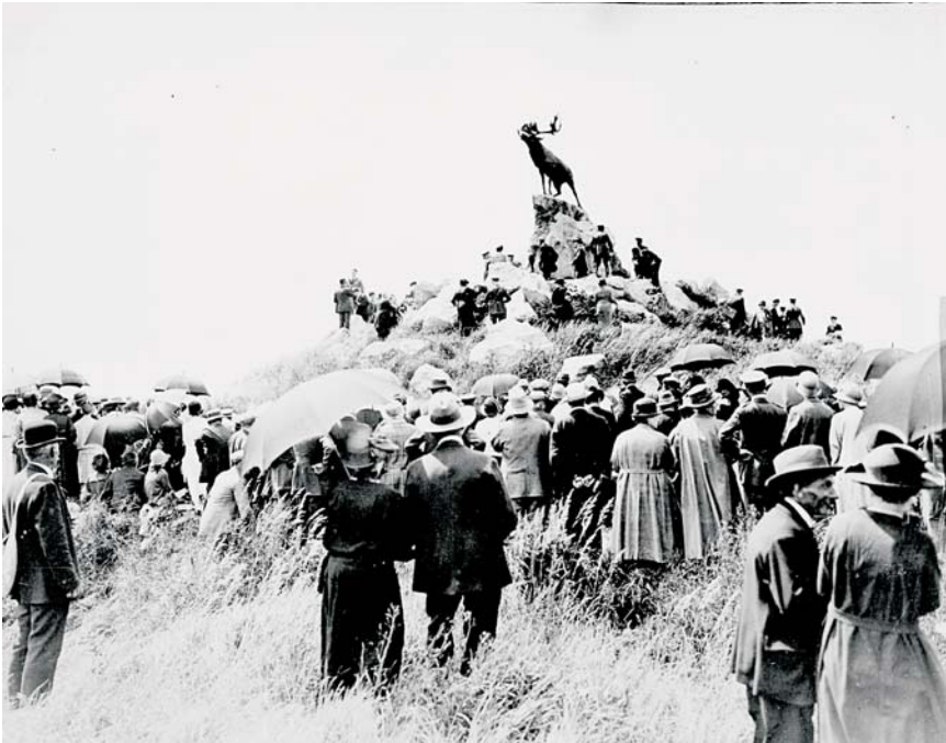
Opening of Beaumont Hamel Park, 1925. PANL NA-3106, Courtesy of The Rooms Corporation of Newfoundland and Labrador, Provincial Archives.

sage. The battlefield was sacred ground which no amount of commemorative development could enhance any further.