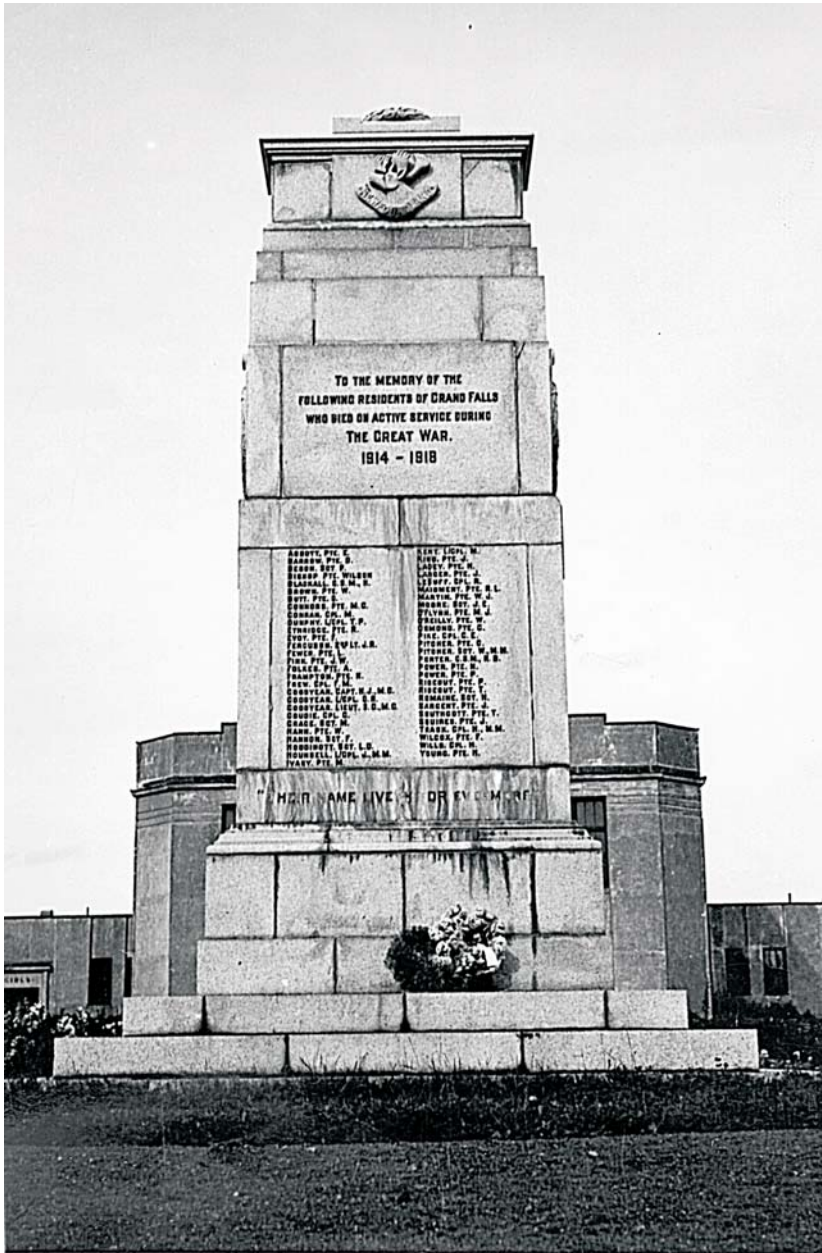
War Memorial, Grand Falls, 1914-1918.