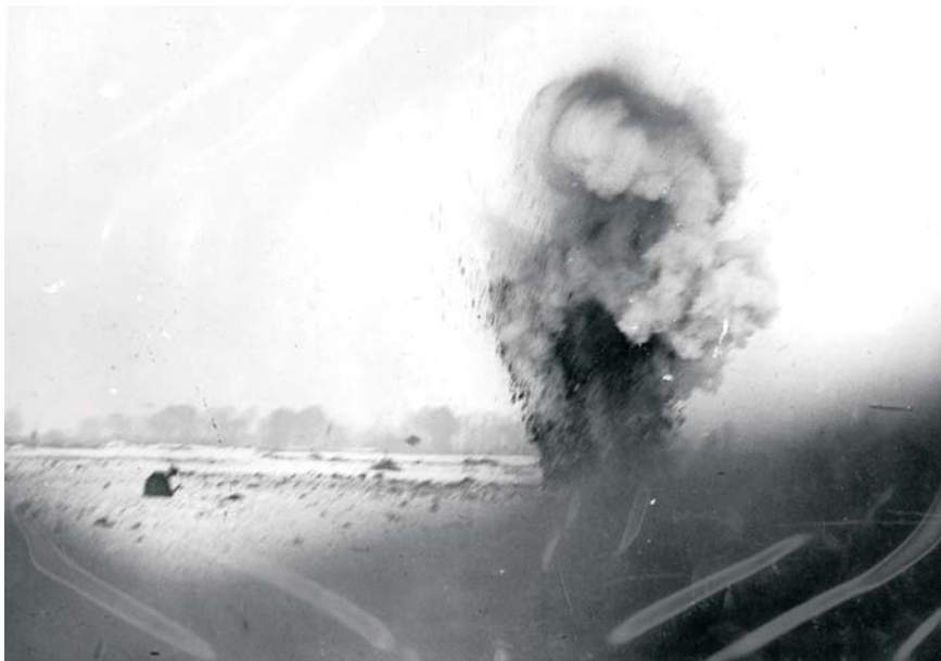
Enemy shell bursting, Beaumont Hamel, c. 1916. Imperial War Museum photograph collection. PANL B-2-42, Courtesy of The Rooms Corporation of Newfoundland and Labrador, Provincial Archives.

The highly anticipated moment came on 1 July 1916. At 7:28 a.m. several mines were blown along the Somme front, and at 7:30 a.m. the infantry advance began. 15 Substantial gains were made by several divisions in the south, but most units were met by a crippling hail of German artillery and machine-gun fire. During the first hour, almost half of the 66,000 Allied troops in the attack were killed or wounded, usually before getting past their own barbed wire. 16 The 29th Division was particularly affected. The 86th and 87th Brigades suffered overwhelming casualties without coming close to their objectives, the first and second lines of the German trenches. The Newfoundland Regiment, a part of the 88th Brigade, received revised orders from General de Lisle at 8:45 a.m., requiring an immediate advance on the German front lines, and hastily prepared for an assault for which it had not trained. 17