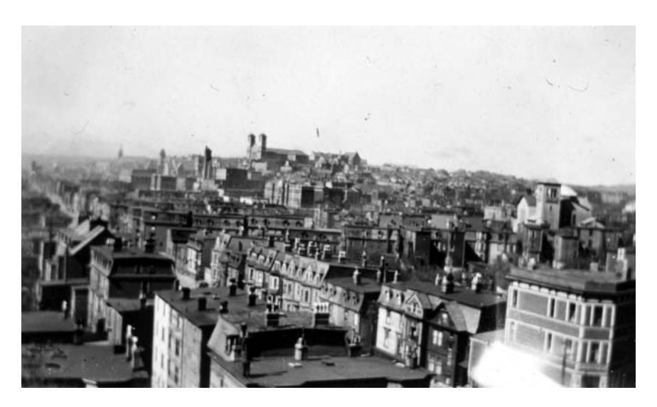
Figure 2. View taken from Mona's room in Newfoundland Hotel, St. John's.

ening clatter as they wound their way along the winding cobblestone roads. "Walking on the streets is quite a hazardous adventure," Mona observed. "The hills are terrific and both the sidewalks (such as they are) and the roads are horribly slippery. There are only a few streets in the city that are paved and so far I have only found pavement on sidewalks of two streets.... We used to worry in Charlottetown about the children sliding [sledding] on the grades, but heavens! that wasn't a patch on what they do here, simply swarms of them on almost every street slipping down the hills onto cross roads with street cars, trucks and what have you." At times Mona missed the amenities of larger Canadian cities. There was no "decent place to go to revive one's drooping spirits with a spot of tea," she lamented to Jane. "Not a good restaurant in the city that is not dear or serves good food — and after 8 pm it is impossible to get a bite in the hotel. What a country! Oh for a Honey Dew or a Murray's." When Mona finally did find something she liked, the storekeepers invariably replied, "'Sorry, but it is out of stock at present,' meaning six months to a year." 10