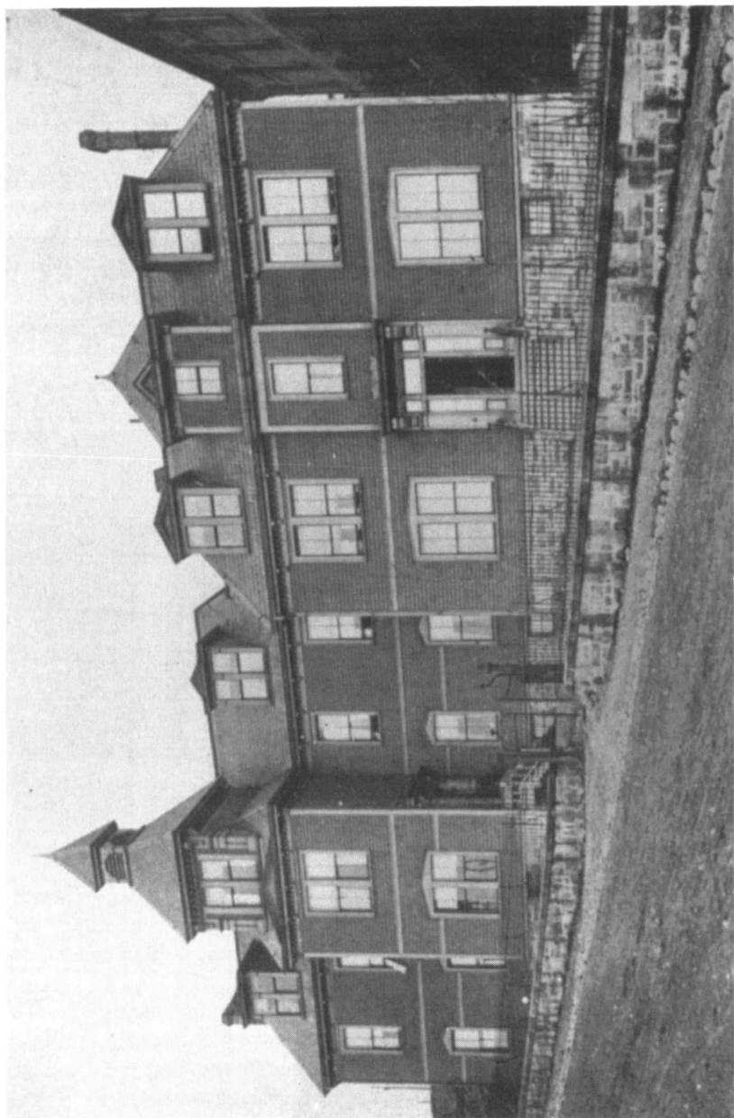
The Methodist College