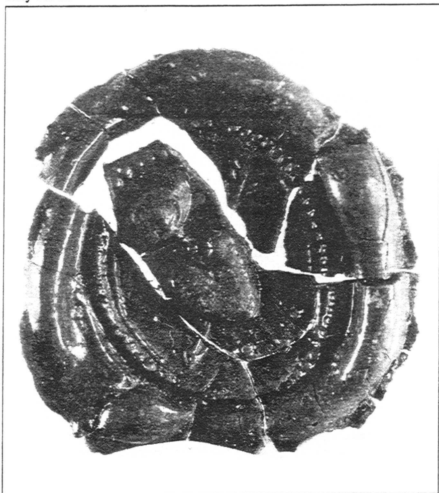
Fig. 2 Partly reassembled fragments of a wax impression from a signet ring. Found in the base of a privy at Site C, the bleeding Immaculate Heart of Mary is clearly Roman Catholic iconography and probably dates from the Calvert era at the Colony of Avalon. Actual diameter about 10mm.

Calvert period when Catholics were resident at the place, or during the 1620s or early 1630s.