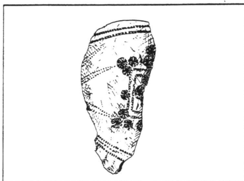
Fig. 3 Drawing of a "Chesapeake pipe" from Site D at Ferryland, shown actual size. Opinion is divided as to whether these distinctive tobacco pipes were made by Native North Americans or Afro-American slaves. What is certain is that they were made in the Chesapeake region of the eastern seaboard and may provide our first tangible "Ferryland - Maryland" connection. Drawing by Daniel Stewart.

with the structure do not conform to what would be expected from the house of a member of the Newfoundland gentry in the late seventeenth century. Although the house was a substantial one, relatively expensive ceramics (e.g. tin-glazed and 'sgraffito' wares) are almost entirely lacking, a situation in decided contrast to ceramic samples from elsewhere in British North America. Glassware and other similar objects are also not well represented among the artifacts found at Site D. The few upscale objects that were recovered — a silver cuff- or waistcoat link, button holes with silver embroidery and two silver coins — do not necessarily indicate that the house was occupied by the gentry. At least one of the coins, a piece of Elizabethan silver dated 1579, is in such good condition that it must have been lost long before the house at Site D was constructed; the other objects may very well have been dropped by one of d'Iberville's men or by one of the Kirkes themselves during a visit to the house.