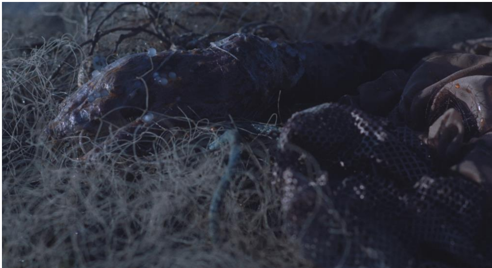
Figure 1: The creature

A creature washes ashore in a Brazilian fishing town. It is tangled in a fishing net; we can only make out its skin, burned by the salt of the ocean, cracked and leathery, adorned with iridescent pearls (Figure 1). A crackling sound, like a muffled dolphin's call, intertwines with the hissing of the sea and its waves, while the camera moves capriciously between the creature's indiscernible body and the faces of eager fishermen that try to untangle it.