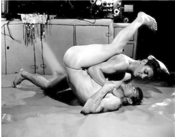
Figure 1: Still from Making of a Monster , Courtesy Bob Mizer Foundation.

Mizer's series of Frankenstein films were shot on markedly similar sets, sometimes identical. Most of the films contained at least some form of electrical machine (often with a climbing high voltage arc), a gurney or laboratory table, makeshift cabinets that on close inspection had drawn-on hinges and doors, and a mat on the floor for wrestling.