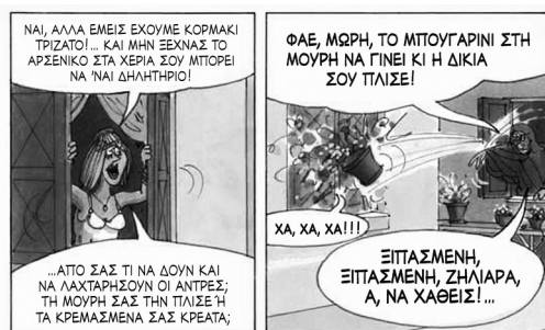
Example 1a: Young/old woman (AW.44)