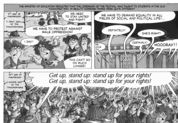
Example 3b: translation (LD/7)

The English translation does not sound as stylised as the original. Language is more accessible, possibly more fitting to a grassroots movement that the Thesmoforia may be the arena for. The main translation problem in this sequence, of course, is the song, which is replaced by another allusion, Bob Marley's Get up, stand up (1973). Such a recontextualisation allows an equivalent incongruous bridging effect. Ancient Thesmoforia is linked to an international anthem of human rights movements. Digital releases by Amnesty International are known to include this song or use the song title in their advertising campaigns. The allusion is deftly integrated into the mise en scène because women singing in unison are actually standing up.