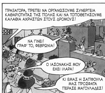
Example 2a: women in parliament (AW/38)