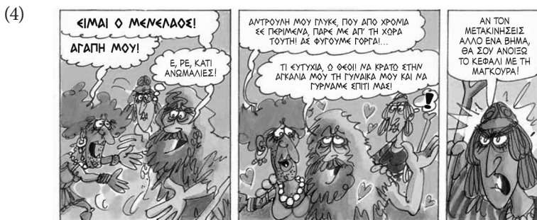
Example 4a: Euripides-Mnesilochus (LD/39)

A similar, overt intervention can be seen in the final episode of LD where Euripides and Mnesilochus role play Helen in order to escape. The accompanying female guard, Krytilla, expresses her disbelief and threatens them.