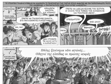
Example 3a: Thesmoforia (LD/7)