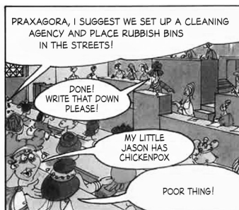
Example 2b: translation (AW/38)

//And our Sappho[+diminutive] recently had mumps!//