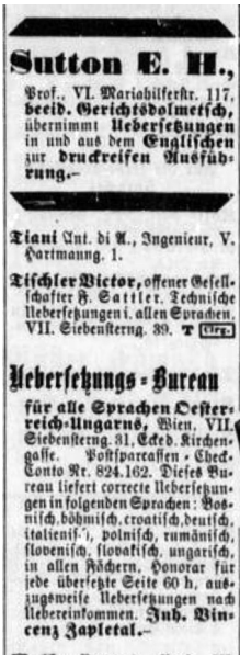
FIGURE 2 Advertisements of translation bureaus (from Lehmann 1903:744) 13