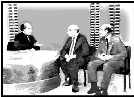
Figure 2. Anderson: I dare say you were there as well, mister translator.

Pointing out the expression “man to man” in the context of an interpreted (tri- adic) exchange goes in line with the host’s normal way of playing with the ambiguity of words and expressions. The audience reacts as expected – they burst out in laugh- ter (2: 332). The interpreter slightly changes his position, leaning a bit back and forth. There may also have been a glimpse of a smile on his face, however, his attention to a point in front of him and the pitch of his voice stays the same. He latches on imme- diately, speaking in Russian, with his usual “poker face” (2: 333). The audience’s laughter (2: 332) makes it impossible to hear exactly what he says, but clearly Gorbachev can hear him, and undoubtedly the interviewee gets to know what the audience was laughing about – Anderson’s linking with “mister translator.” Catching on directly to what Palazchenko says on the host’s behalf, Gorbachev looks at Anderson and points at the interpreter. 6