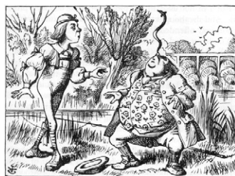
Father William balancing an eel

“You are old,” said the youth, “one would hardly suppose That your eye was as steady as ever; Yet you balanced an eel on the end of your nose – What made you so awfully clever?”