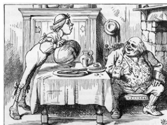
Father William's healthy appetite

“You are old,” said the youth, “and your jaws are too weak For anything tougher than suet; Yet you finished the goose, with the bones and the beak – Pray, how did you manage to do it?”