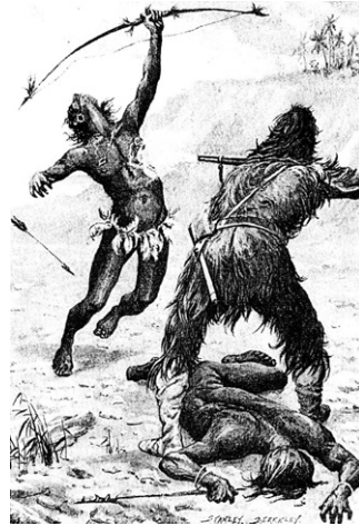
Crusoe killing a cannibal