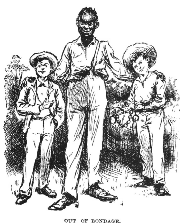
OUT OF BONDAGE.