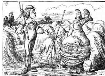
Father William standing on his head

"You are old, father William," the young man said, "And your hair has become very white; And yet you incessantly stand on your head – Do you think, at your age, it is right?"