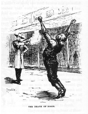
The death of Boggs