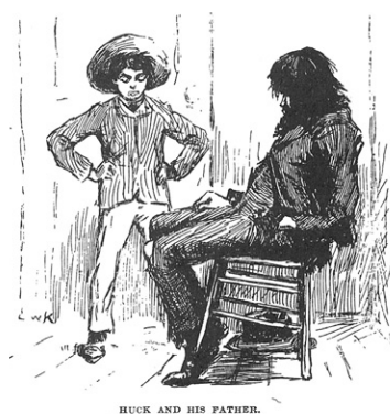
Huck and his father