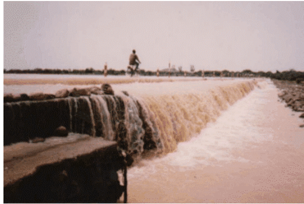
Figure 4. Image extracted from the Puertoterm image bank to illustrate the “concept flood”.

Since there is evidence that situated simulation (Barsalou 2003) is a powerful interface between perception and cognition, we believe that just as the development of process-oriented terminology banks (Faber et al, in this volume) should include contextually-relevant properties of the focal category, the image should also bear a close relation to the focal categories. For example, when searching for the lexical item flood in our corpus, the word is usually accompanied by information regarding the consequences of floods for human populations. It is quite likely that the images accompanying these texts use human features to illustrate the concept, such as those in figure 4.