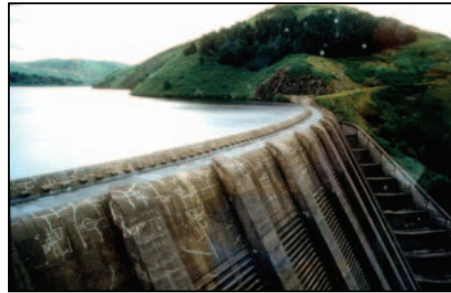
Figure 1. Examples of an inadequate image to illustrate a concept (left) and an adequate one (right) on the grounds of prototypicality.