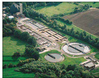
Figure 2. Two different images to illustrate the concept “water pollution”.

In the context of text analysis prior to translation, it is therefore important to include image analysis as an important issue regarding the adequacy of an image in terms of catalyser of the function and focus of a particular text. Furthermore, as the eye meets the visual information before the textual one, processing information through graphic input might well condition the later understanding of the information contained in the text. As Lee-Jahnke (2005: 363) puts it for the case of mental representations: