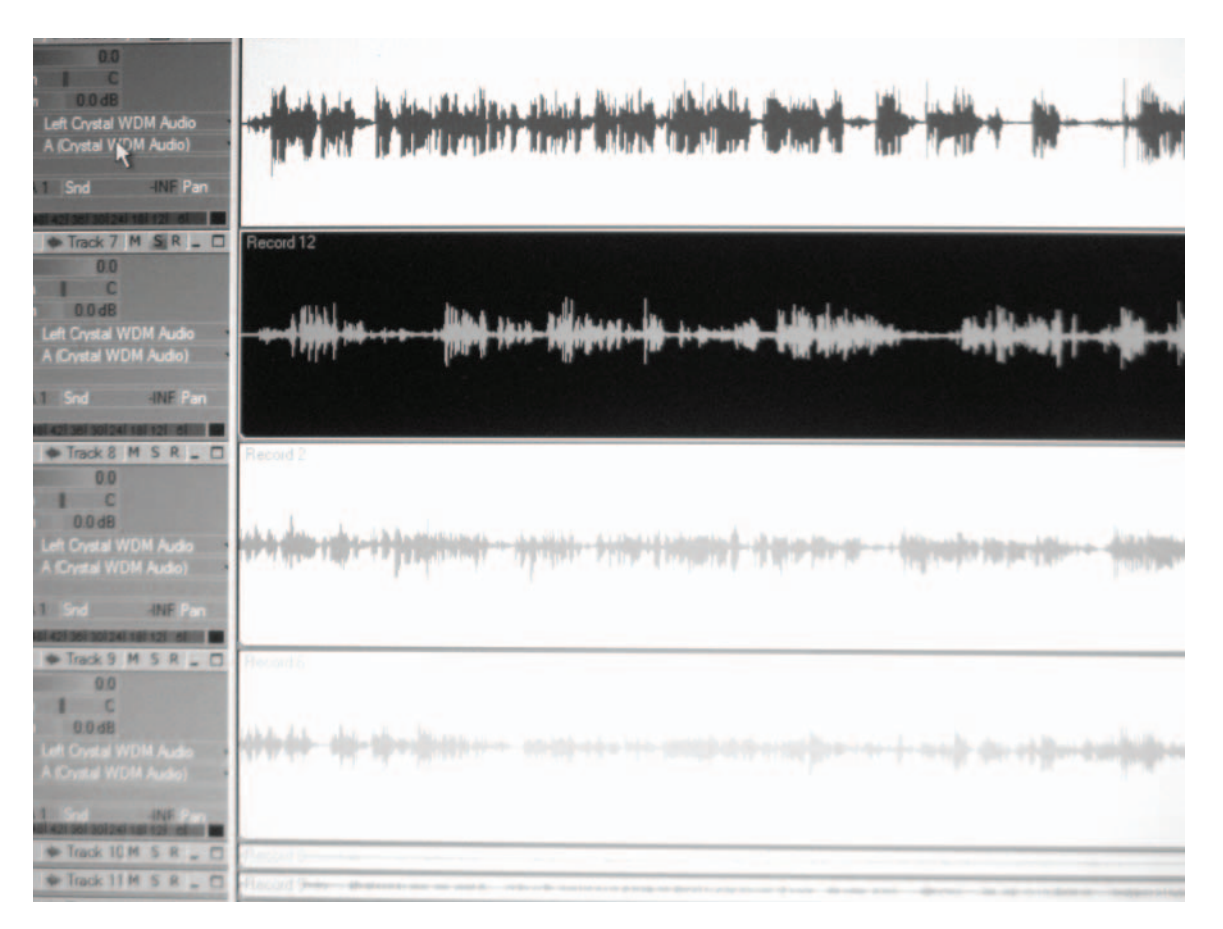
Figure 1. Visual representation of audio recordings of interpreter renderings