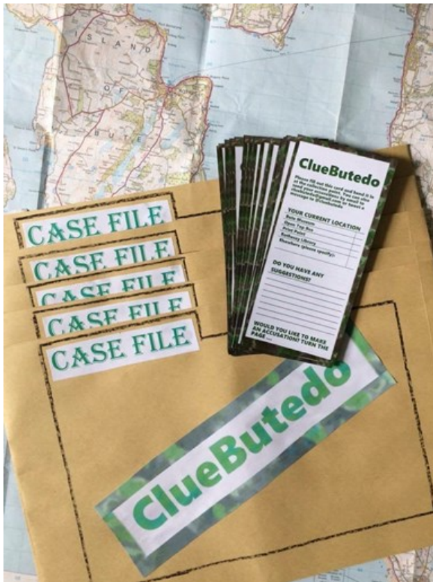
Figure 12: ClueButeDo forms and Bute map.

The two-sided form we created, dubbed “ClueButeDo” (a portmanteau of Cluedo and Bute), began with information about how to return the form, including a Gmail address and a Twitter handle (both of which would be quite difficult ways to return a paper form). The form asked the respondent to tick their location, with boxes indicating various festival sites: Bute Museum, the open top bus, Print Point (the bookshop), Rothesay Library, or elsewhere. Next, it asked, “Do you have any suggestions?”, with several lines of space for free-text answers. The jump to this open question, without asking for any further information other than current location (that is, missing out typical demographic information) was intentionally done to disrupt the standard questionnaire pattern. The respondent was then prompted to go overleaf with the text, “Would you like to make an accusation? Turn the page...” (An “accusation” in Cluedo terms is used when one of the players suspects they have sufficient evidence to state the details of the murder.) On turning the page, respondents were then asked to tick boxes of “Whodunnit?” (with choices of names of authors appearing at the festival), “With what weapon?” (featuring items from the Bute Museum used in its Facebook promotion of the festival), and “Where was the murder