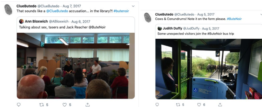
Figure 15: @ClueButedo's Sherlockian interventions.

After the online and in-person promotion of the feedback form, there were eventually 36 forms returned (in person, to Claire plus a few to venue staff), a response rate of approximately 4 percent of ticket sales (we did not have figures for individual attendee numbers). We aggregated the data and created a report for the Festival Director, which we also shared with the venue managers at the museum, library, and bookshop. In our feedback we noted that (as predicted) some individuals found the format of the form perplexing, but others got into the spirit of it. Some did wonder if there were clues they should be looking for, which perhaps could be integrated into an event the following year. We suggested that as many people attended multiple events, constructing an activity based on ClueButedo to run across the festival might work well.