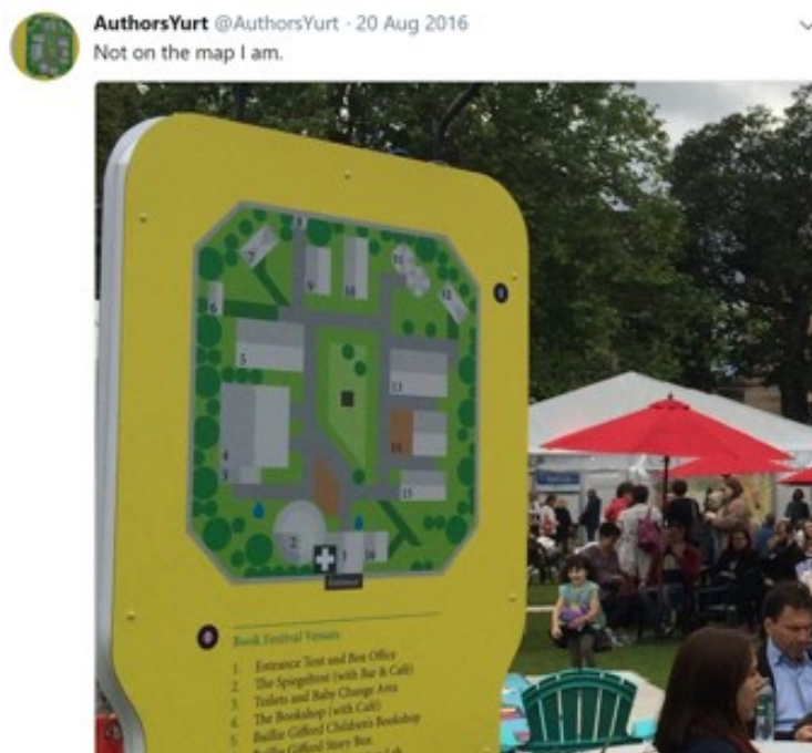
Figure 5: @AuthorsYurt notes it is not on the map.

Some authors enthusiastically embraced the possibility of having an online conversation with @AuthorsYurt, taking advantage of Twitter's interactivity. A.L. Kennedy, whose observations in On Writing we referred to earlier, seemed particularly taken with @AuthorsYurt, comparing its turns-of-phrase to Yoda's, and sending a series of cheeky tweets. Adding to the humour, a second Authors Yurt account was set up (by person or persons unknown to us), then a third joined the fray, flirting with horse gifs and the lure of the Mongolian plains. The original @AuthorsYurt took the opportunity to satirize the quantification tendency of creative industries discourse, by counting the number of Authors' Yurt accounts. In response to a journalist's tweet that reported festival "ticket sales up 3.5% and more than 62,000 books sold this year," @AuthorsYurt tweeted, "Also, talking yurts 3 from 0 up." 42