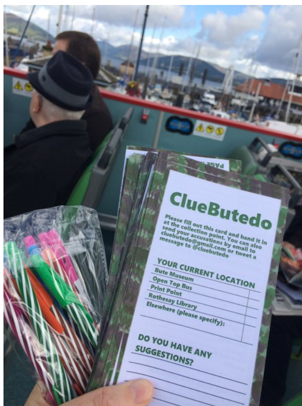
Figure 14: ClueButedo forms and stripy pens on the open top bus tour.

members' anxiety, though others were still discombobulated. Some festival attendees asked questions about the form, including whether it was designed to elicit a particular kind of feedback, and whether it would be compared to other datasets, including to see whether more people reply than normal. 62 These were all very sensible questions, but at odds with our actual research aim, which was to play creatively with ideas of feedback and participation.