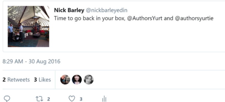
Figure 7: @AuthorsYurt goes back in the box.

Box we may enter, but the spirit, like the thundering of hooves, lives on