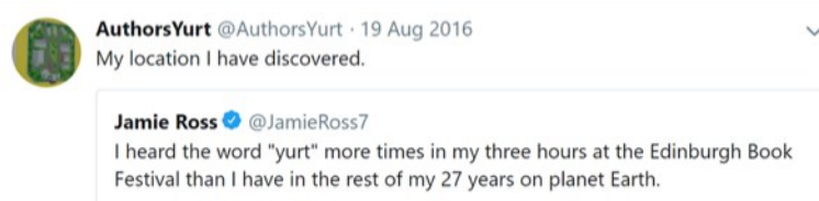
Figure 4: @AuthorsYurt discovers its location.

@AuthorsYurt also retweeted the sharp observation in Figure 4 about the overuse of the word “yurt” at the festival, to emphasize both the Yurt’s cultural and physical (dis)location, and the satirical intent of the account: 37