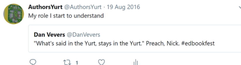
Figure 3: @AuthorsYurt achieves consciousness of its role.

@AuthorsYurt also retweeted the sharp observation in Figure 4 about the overuse of the word “yurt” at the festival, to emphasize both the Yurt’s cultural and physical (dis)location, and the satirical intent of the account: 37