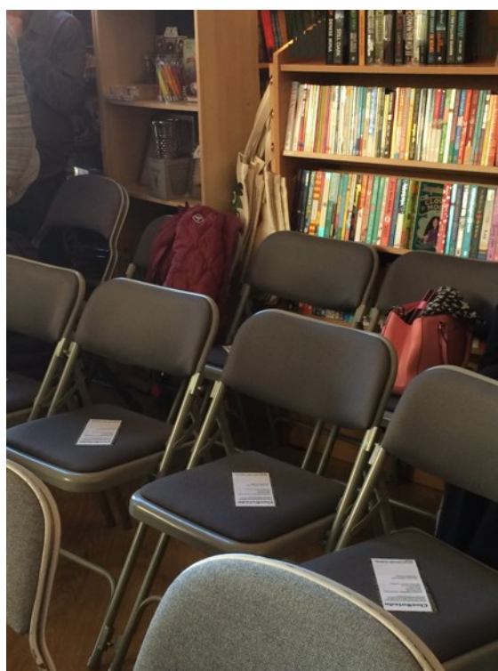
Figure 13: ClueButeDo forms on bookshop chairs.

Claire then set off on bike, train, and ferry to Bute with copies of the blank forms and a map in her cycle panniers (Figure 12). On arrival, she purchased some 20 stripy pens for £1 from a seafront shop (pleasingly, these looked like thin versions of rock, a typical British seaside sweet). Meanwhile, Beth had set up the project’s Twitter account (@ClueButeDo), and began to tweet, responding to authors arriving on the island and audience members excited about meeting them, and using alliterative phrases to establish the account’s voice and perspective on mysterious matters.