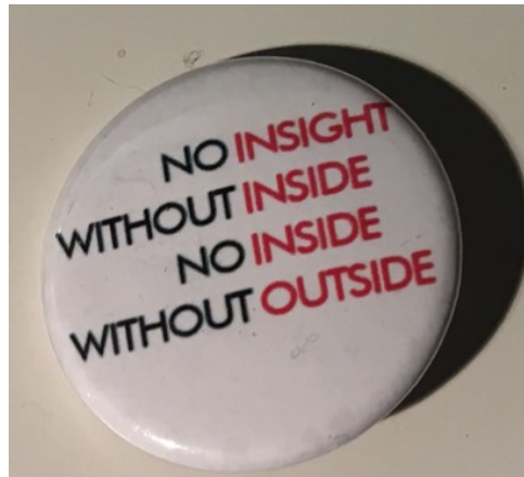
Figure 1: Nunu Otot button badge.

NO INSIGHT WITHOUT INSIDE NO INSIDE WITHOUT OUTSIDE