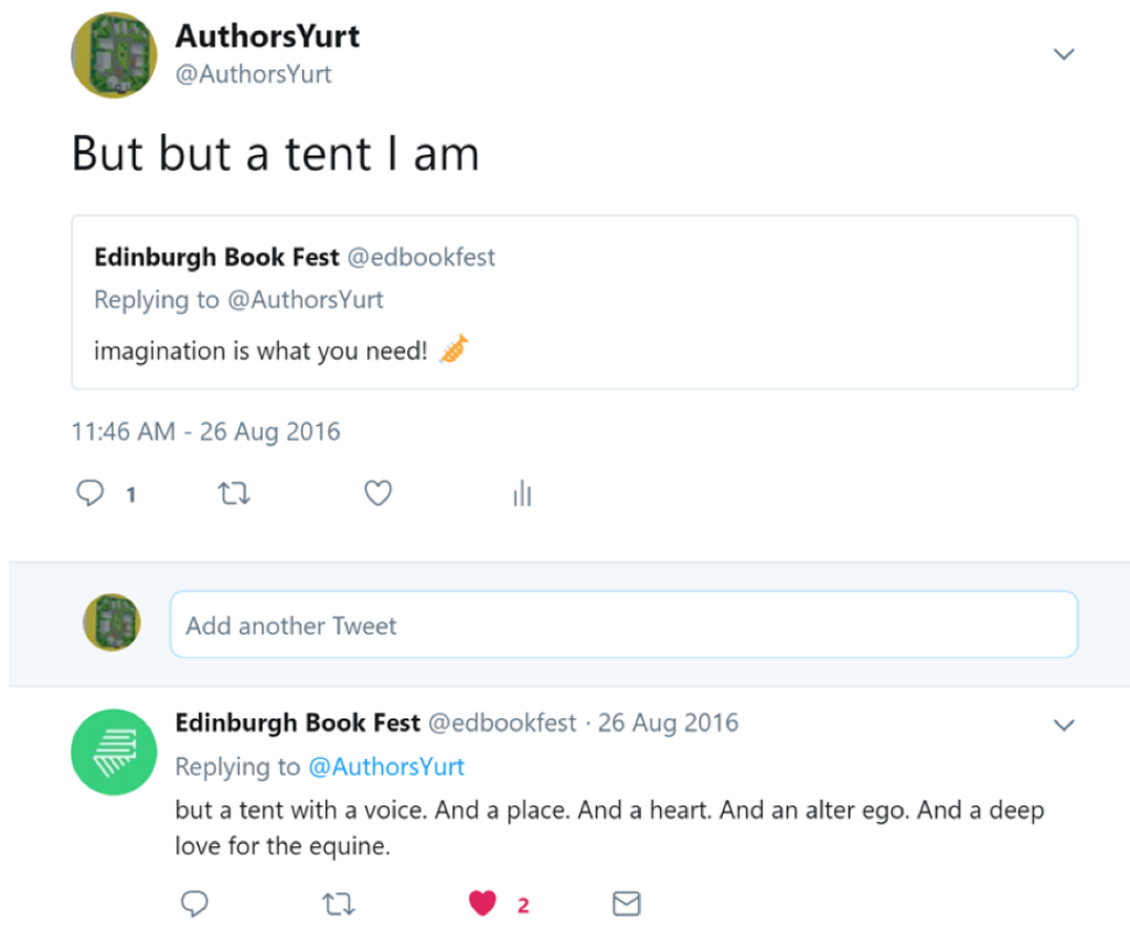
Figure 6: @AuthorsYurt's exchanges with the official Edinburgh International Book Festival Twitter account.

There were exceptions to this warm reaction, however. The Festival Director seemed less enamoured. When @AuthorsYurt sent a tweet that read “Confused, I am,” the Director responded by quoting it with the single-word commentary, “Limpid”, a response ironically lacking in clarity. @AuthorsYurt replied deferentially: “I understand. The drawstrings are tightly sealed.” 44 When the festival eventually ended, @AuthorsYurt signed off—but not without the Festival Director declaring his wish to put @AuthorsYurt and @authorsyurtie (the more active of the additional accounts) back in a box (Figure 7).