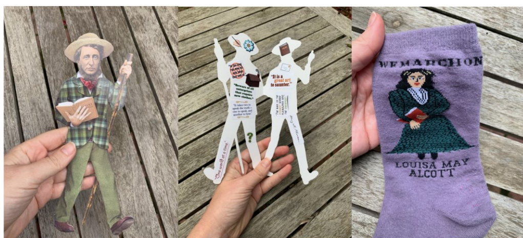
Figure 8: Literary tourism: Transcendentalist paper doll cards and socks.

In the era of late capitalism, cultural tourism, Etsy, and quirky merchandising, it is not very surprising to come across dolls made to resemble literary figures. Fans of writers can buy such products as an expression of their enthusiasm, just as they may buy other literary merchandise, or undertake pilgrimages to literary sites and writers’ houses. 46 On a tour of Massachusetts writers’ houses in 2019, for example, we bought paper doll cards of Ralph Waldo Emerson and Henry David Thoreau, adorning them with quotable stickers. We also bought socks that feature a doll-like image of Louisa May Alcott under the slogan “We March On” (see Figure 8).