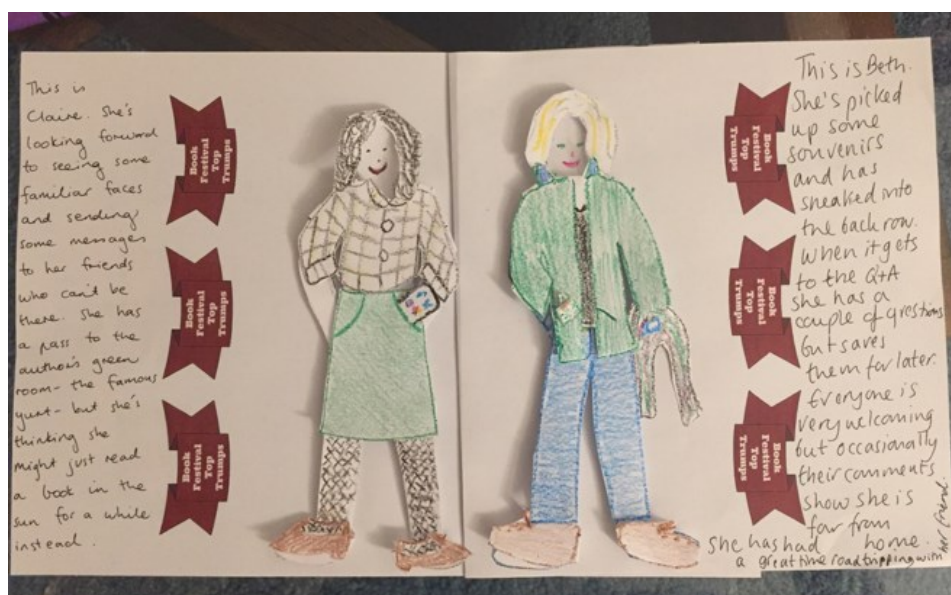
Figure 11: Paper dolls: Claire and Beth.

At a certain point in the creation of these six characters, one of us became uncomfortable with the objectification and simplification that our paper doll experiment involved, and demanded that we make paper dolls of ourselves as well. We made dolls of each other (Figure 11), a process which required a lot of trust (“Don’t make me look hideous!”) and pre-emptive forgiveness (“I’m sorry I’m so bad at drawing!”).