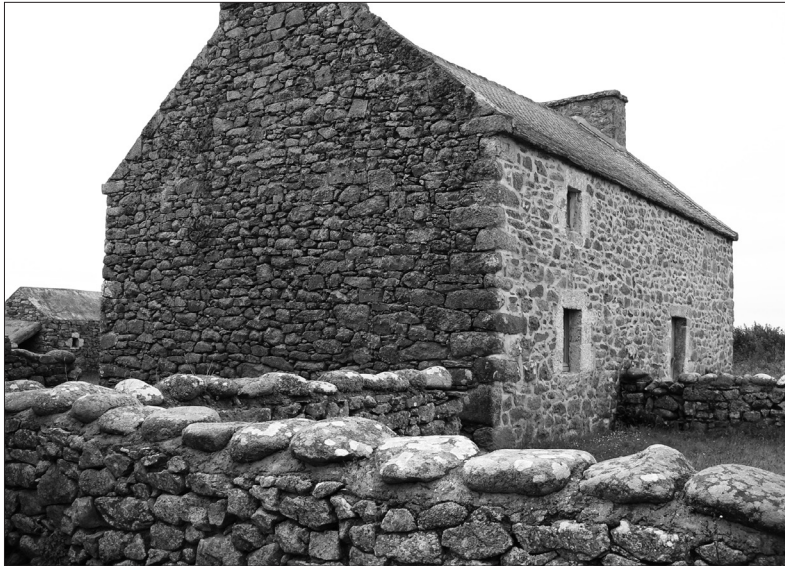
Fig. 7 Écomusée Niou, Ouessant, June 2006.

Many ecomuseums, likewise, encourage the visitor to make contact with various “antennae” sites in the landscape that inform an intangible sense of place that the museum aims to conserve and promote (Davis 2005: 368).