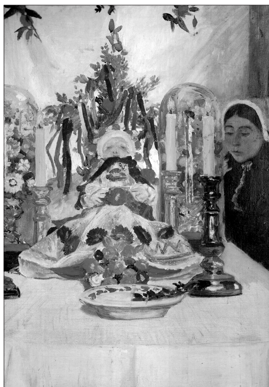
Fig. 12 Charles Cottet, Wake of a Dead Child on Ouessant (1897) Quimper Museum of Fine Arts. Photo by author, October 1997.

The text at Niou (quoted above) speaks of the banality of infant mortality in the late 19th and early 20th century, a time when such loss was more acceptable and representable. Historian of the island, Françoise Péron (1997) reiterates the ecomuseum's assessment of Cottet's painting, that the death of an infant was not a sad affair at the time, as he or she was ensured to go straight to heaven. She also tells us that this attitude on the part of the Islanders seemed monstrous to outside observers (222). In its presentation of the material culture of death, mourning and memory, the Niou ecomuseum displays its marriage globes both as objects that bore material witness to crucial moments in the life of the family, and as objects that served to represent Ouessantine customs to the outside world.