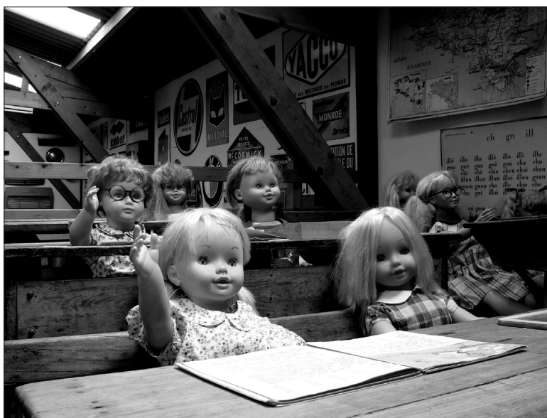
Fig. 9 (Top) A Breton interior at the Lizio Ecomuseum.