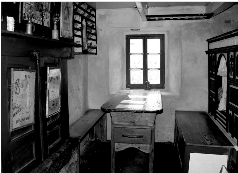
Fig. 8 Box beds face the table and hearth in the Écomusée Niou.

La Maison du Niou Uhella (Fig. 7) the “premier ecomuseum of France” (Davis 2005: 368) opened in July of 1968, prior to the invention of the category. This building, in the tiny hamlet of Niou Uhella on Ouessant later became the centrepiece of the Écomusée de l’Île d’Ouessant. It is a slate-roofed, stone cottage, in which compartmentalized spaces of two rooms served as kitchen, dining room and bedroom are typical of house styles ca. 1900 (at about this time of relative prosperity, many families replaced thatch roofs with slate (Péron 1994: 32)).