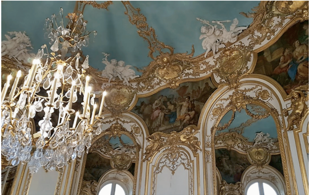
Figure 2. Germain Boffrand, Salon de la Princess at the Hôtel de Soubise , 1738–40. Paris.