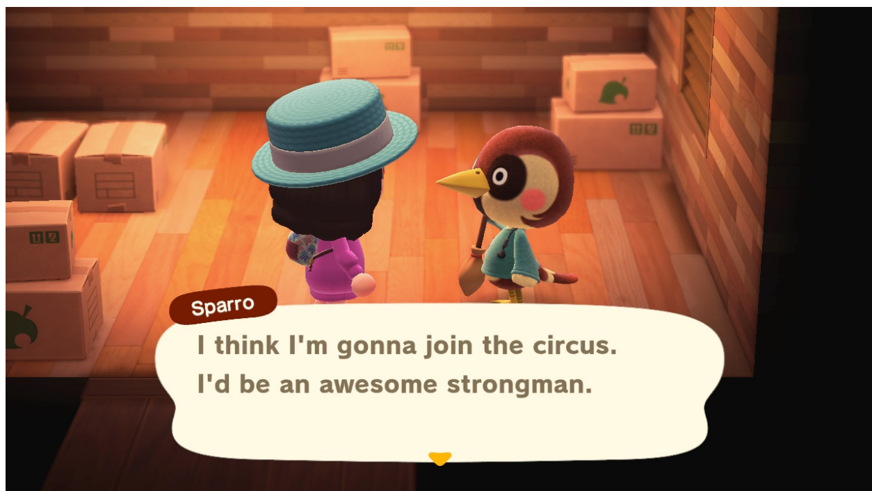
Figure 2. A villager packing up his belongings while saying goodbye to player

These three elements, repeatability, necessity and reliance, play heavily into the functionality of goodbyes within Animal Crossing . Goodbyes come with repeated frequency, they free up necessary inventory space and thus players become reliant on them without even being aware of it. Despite the intricacies of goodbyes, for the purpose of relating them to Animal Crossing it is most convenient to understand goodbyes as the sentiment of separation (Shishikura, 2017, p.232) (see Figure 2 ). The goodbye is not just a moment where that specific word is uttered, but rather it is a general act of separation that is afforded through Animal Crossing ’s inventory space. Most importantly though, these goodbyes are not forced, but rather afforded as choices to the player and exist on a scale of meaningfulness.