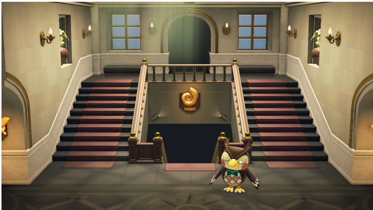
Figure 3. Museum that houses a player’s fossils, fish, bugs and art collections

Collecting effects multiple avenues of gameplay. There is emphasis placed on collecting fruits that fall off trees or shells that wash up on shore to exchange for bells, the in-game currency. In order for the player to expand and furnish their house and pay off debt, the player must initially collect things around the town to sell in exchange for bells. A level of social interaction with villagers is reliant on collecting as well, given that the gameplay involves finding a random item on the ground and searching for the owner of that item, or simply gifting villagers with certain items that the player has collected over time. Interactions with villagers would be limited without the mechanic of collecting. The mechanic of collecting is most clearly emphasized through the museum that appears within every game (see Figure 3 ), which encourages players to donate each unique bug, fish, fossil or sea creature they find and have a record of their collection. However, the affordance of inventory space is also a foundational element which precedes collecting and encourages collecting to take shape as a mechanic.