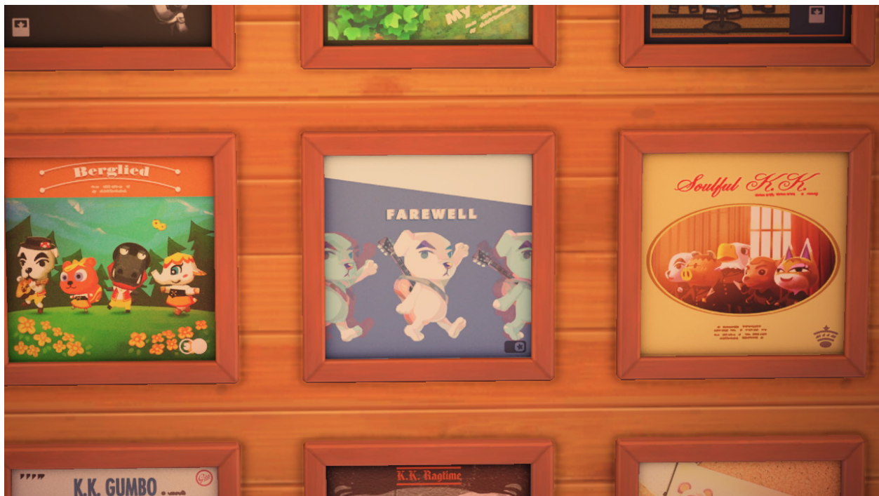
Figure 6. Album cover for K.K. Slider's 'Farewell'