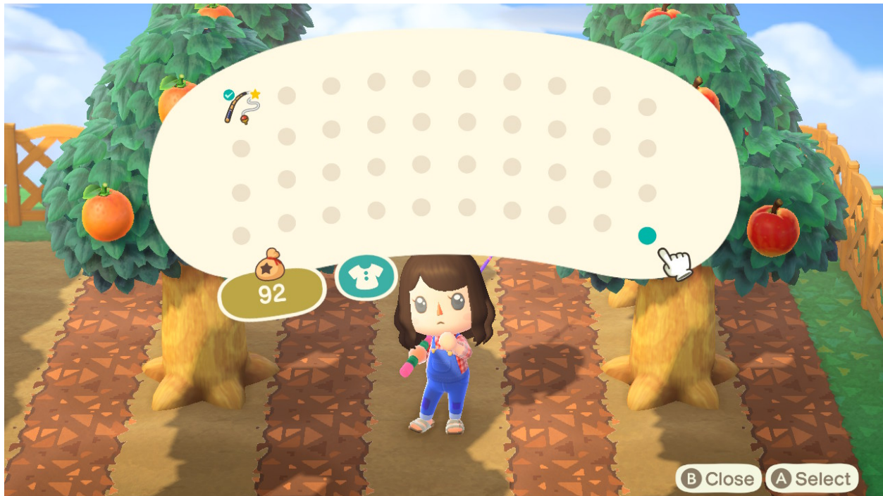
Figure 4. Free spaces of pocket inventory