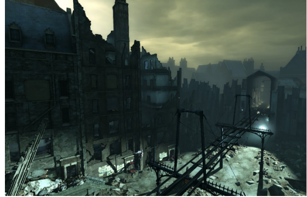
Figure 14 - Ruins in the condemned Flooded District, where very few survivors hide from the City Watch. The train tracks are used to transport and dump the bodies of plague victims.

choices. In low chaos, the ending shows Emily Kaldwin rising to the throne as a benevolent and loved ruler, bringing the city of Dunwall back from the brink of destruction into a golden age as a cure for the rat plague is developed. Conversely in high chaos, Emily will either begin a sadistic reign of terror influenced by Corvo's violent actions or be absent completely if she died in the final mission. In this case the ending shows the rest of Dunwall being decimated by the plague as Corvo flees the city on an outbound ship. The horrors of the plague experienced in the Flooded District provoke moral reflections on the consequences and influence of the player's actions. Fraser (2015) notes that "the dimension of exploration is one way in which the visual or surface content of ruins-in-games moves beyond the symbolic to shape activities that may impact or facilitate gameplay" (p.26); in this instance, we argue that it impacts the player's role as an ethical agent. Architecture in Dishonored works to shape the player's ethical agency through their interactions and observations in Dunwall by providing motivation (or deterrence, depending on their moral code) to redeem the city and save the lives of the citizens of Dunwall.