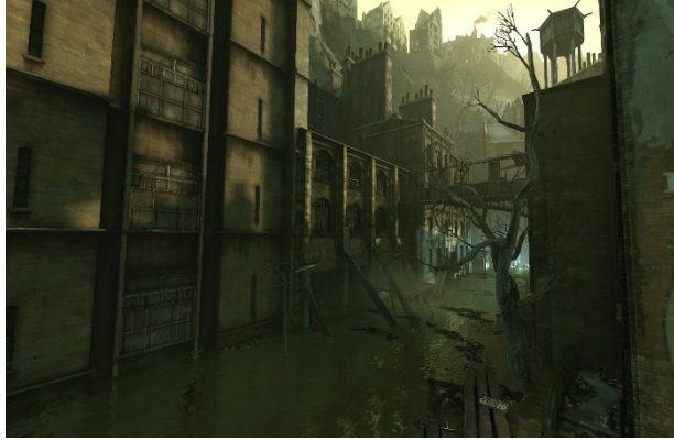
Figure 13 - Submerged warehouses and refineries litter the Rudshore Waterfront in the Flooded District, inhabited only by hostile river creatures and infected plague victims.