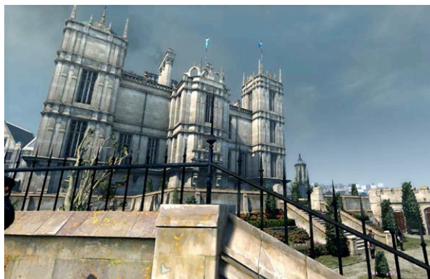
Figure 7 - Dunwall Tower in the opening prologue of the game. The player is unable to progress past the steel fence, but is allowed to explore a small area outside.