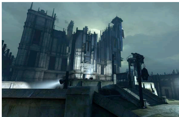
Figure 8 - Dunwall Tower following Hiram Burrows' rise to power. The lighting serves to emphasise the building's menacing visage.