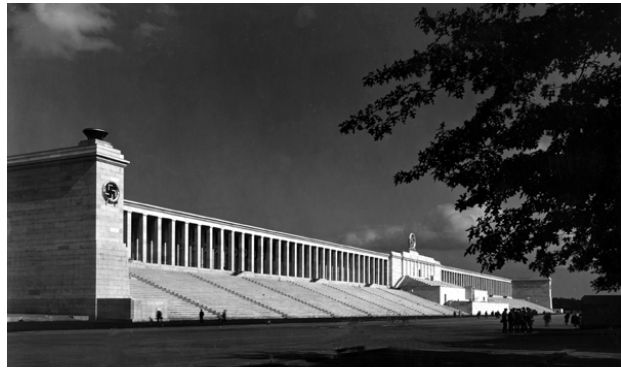
Figure 2 - The Zeppelin Grandstand, designed by Albert Speer, a part of the Nuremburg Rally