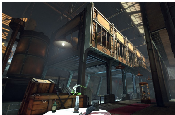
Figure 6 - The interior of Sokolov's Safehouse. The warehouse has been repurposed, and the new steel structure appears like a foreign life form tentatively hovering within the space.

in the context of our subsequent assertion that architecture is reflective of the morals of those who build and dwell within it. The following architectural examples in Dishonored demonstrate how architecture is used as visual metaphor for important characters to convey information about the game's main characters, similar to how architecture is utilized in other visual media.