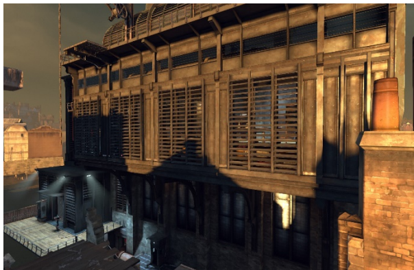
Figure 5 - The external façade of Sokolov's Safehouse. The steel structural addition is attached to the original brick façade by enormous metal corbels, casting it in shadow while the addition is allowed full solar access.