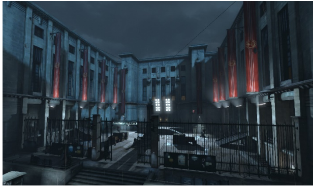
Figure 1 - The Office of the High Overseer