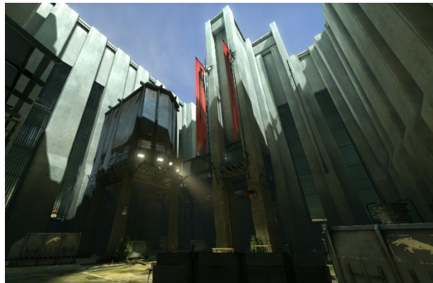
Figure 3 - An Internal courtyard of Coldridge Prison