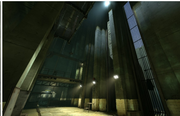
Figure 4 – An internal hallway in Coldridge Prison.