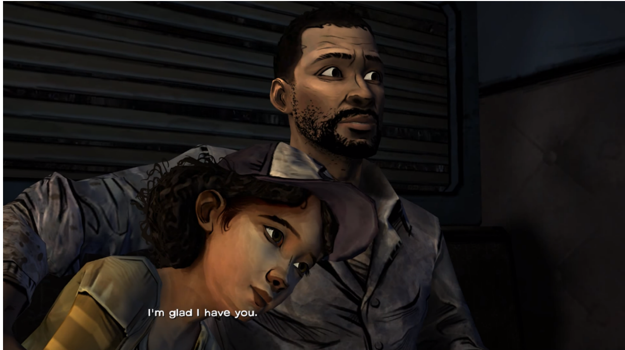
Figure 2: Lee and Clem. Screenshot taken from The Walking Dead: Season One