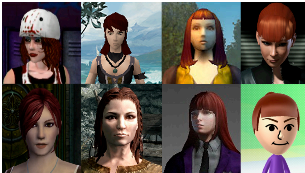
Figure 1: Eight avatars created in the micro-autoethnographic task.

Once I had completed preliminary notes and analyses on my past experiences playing and customizing avatars in each of the game spaces, I then proceeded to create a trans-ludic, representative avatar in each game: World of Warcraft , EVE Online , Saints Row IV , Jam City Rollergirls , Skyrim , RuneScape 3 , Rift , and the Mii Creator . Resultant avatars are shown in Figure 1. Subsequent video footage was then transcribed and analyzed for UI selection and manipulation events. In addition, a reflective narrative on the experience was also recorded by hand and included in the analysis.