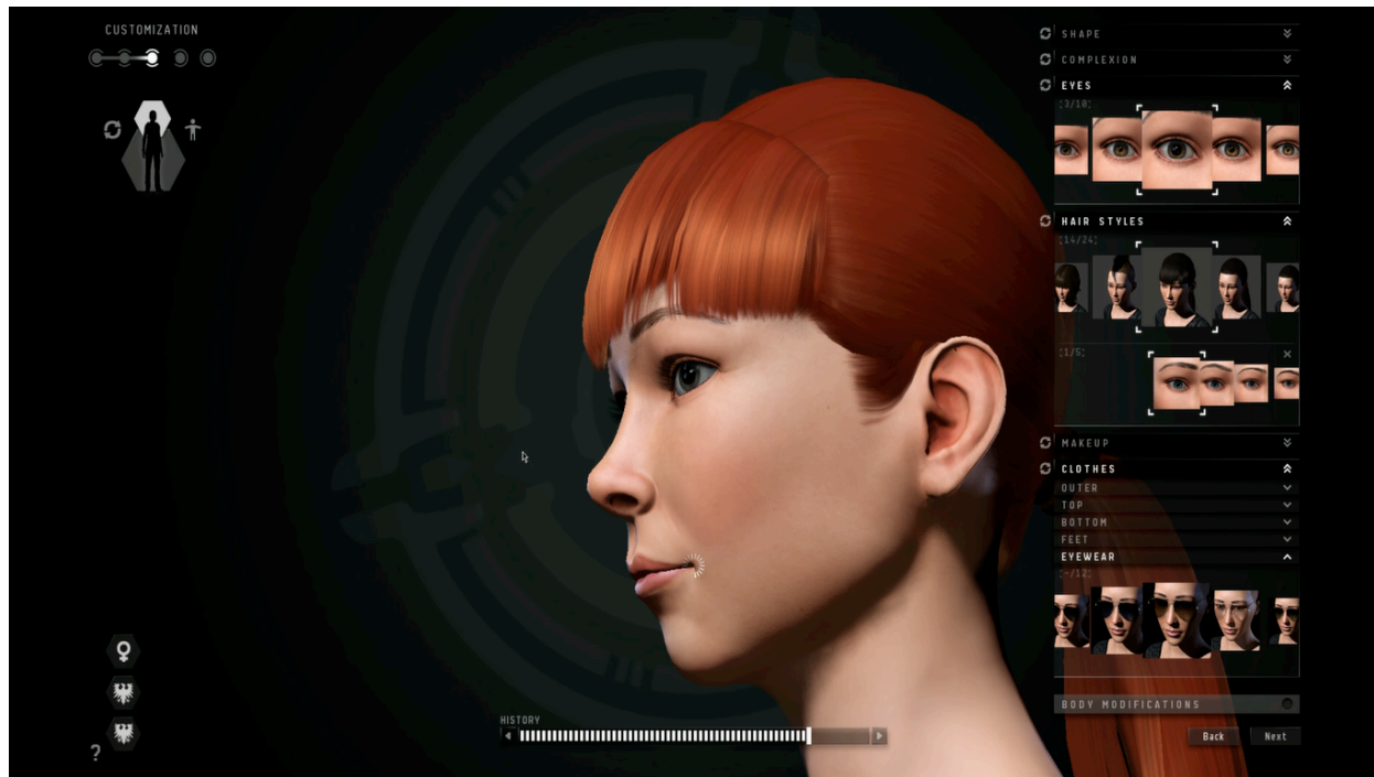
Figure 3: Creating my avatar in EVE Online.

Each interface was chosen due to my own familiarity and past experiences with these games. In all cases, I had spent a year or more playing with avatars in each of these ludic spaces. Notably, the interfaces vary with regard to complexity. For example, the Mii Creator and RuneScape 3 interfaces are both relatively low-fidelity affordances. In contrast, Saints Row IV , Skyrim , and EVE Online offer relatively high fidelity CCIs and produce more realistic looking avatars.