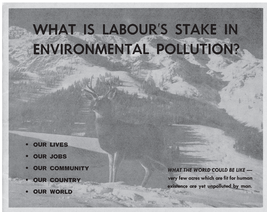
Figure 1. What Is Labour's Stake in Environmental Pollution? (1971), booklet cover page.

Reproduced by permission from Canadian Labour Congress (Calgary Office) fonds, Glenbow Archives, University of Calgary.