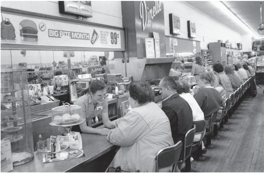
The WAC argued that many women were “lunch counter” servers with lower tips and wages.